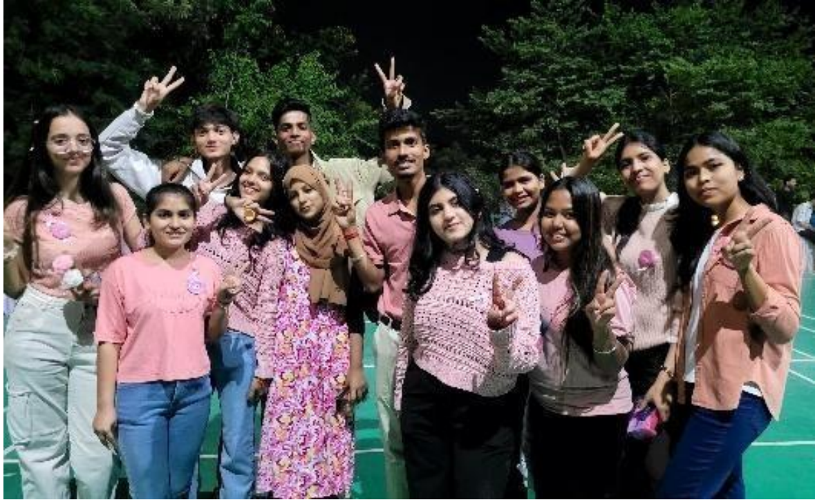
A photograph of the volunteers