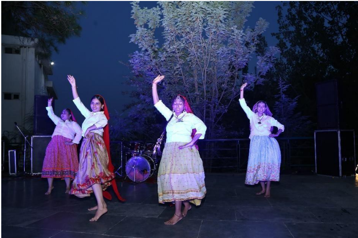
A group of girls presenting a cultural dance performance