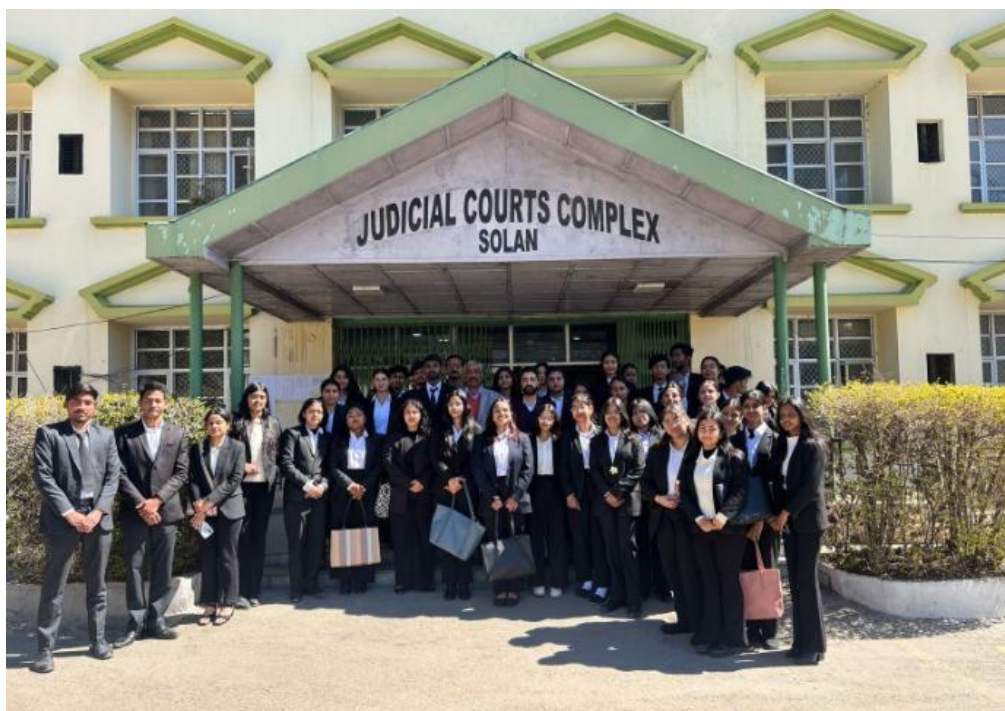
Law students visit the District Court, Solan