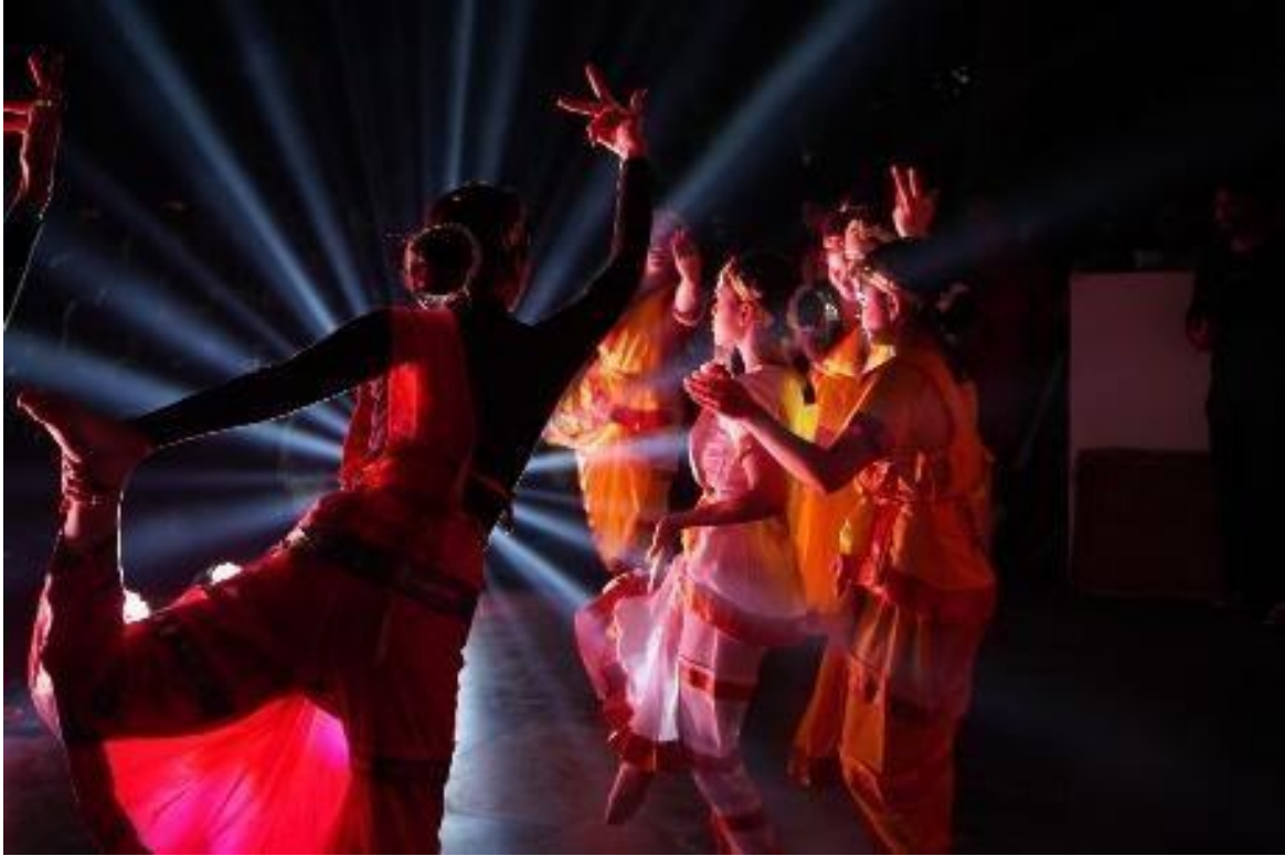
A Kathak dance performance was presented by the students