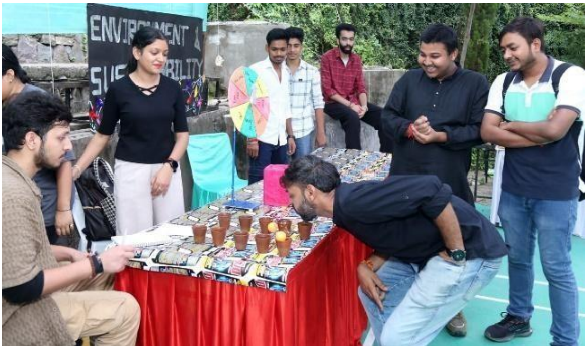
Food stalls were set up by the students