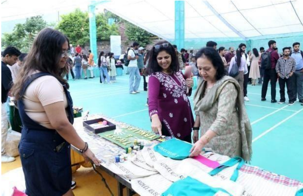
Sustainable bags were sold by the students