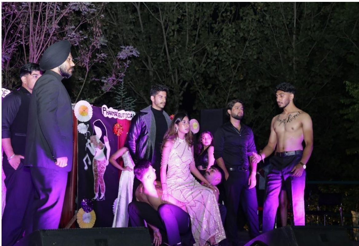
Students of Pharmaceutical Sciences presenting a cultural performance