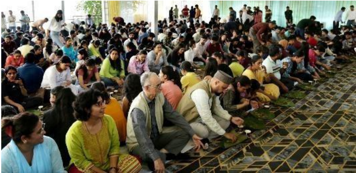
A photograph of the Dham organized for students and staff