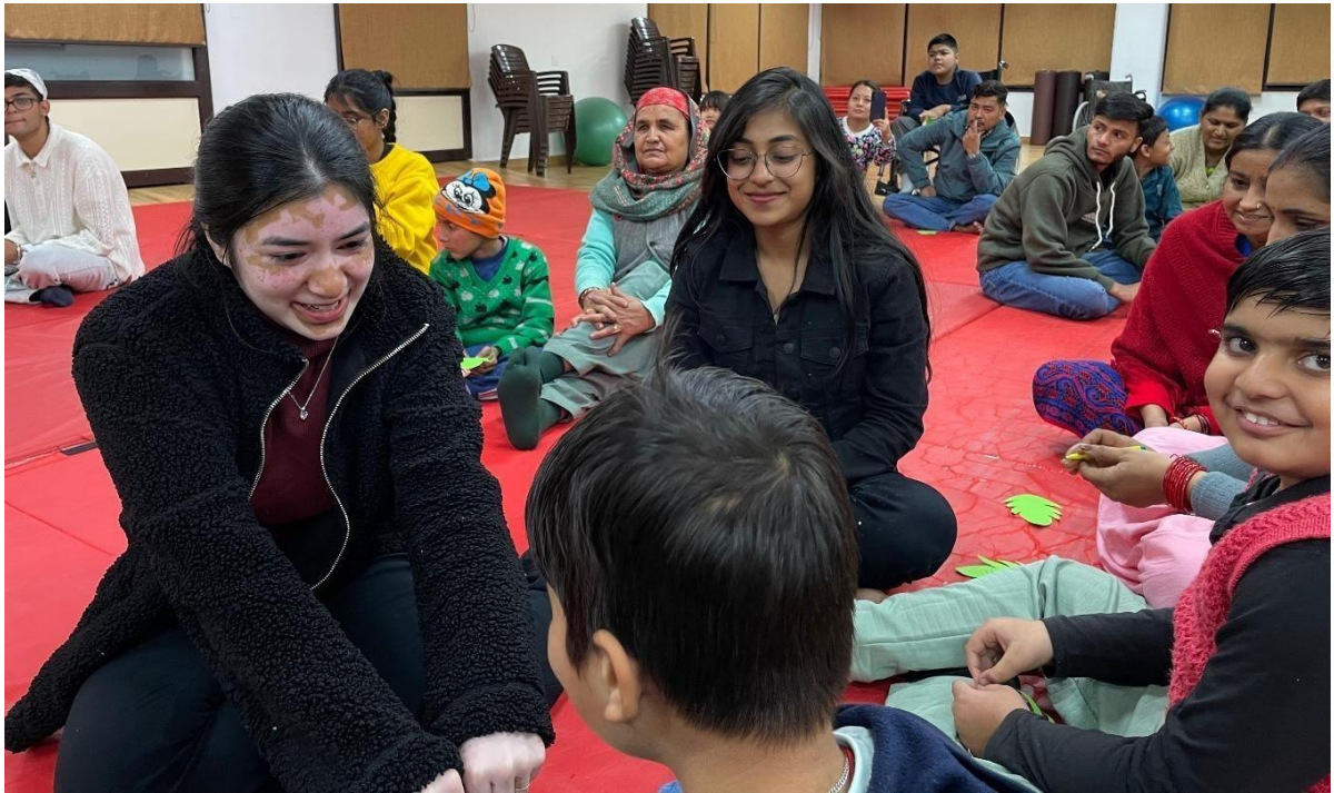
Volunteers socializing with Muscular dystrophy warriors