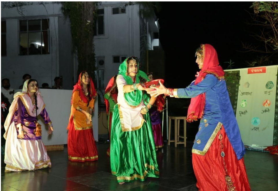
Students and faculty members presenting a dance performance