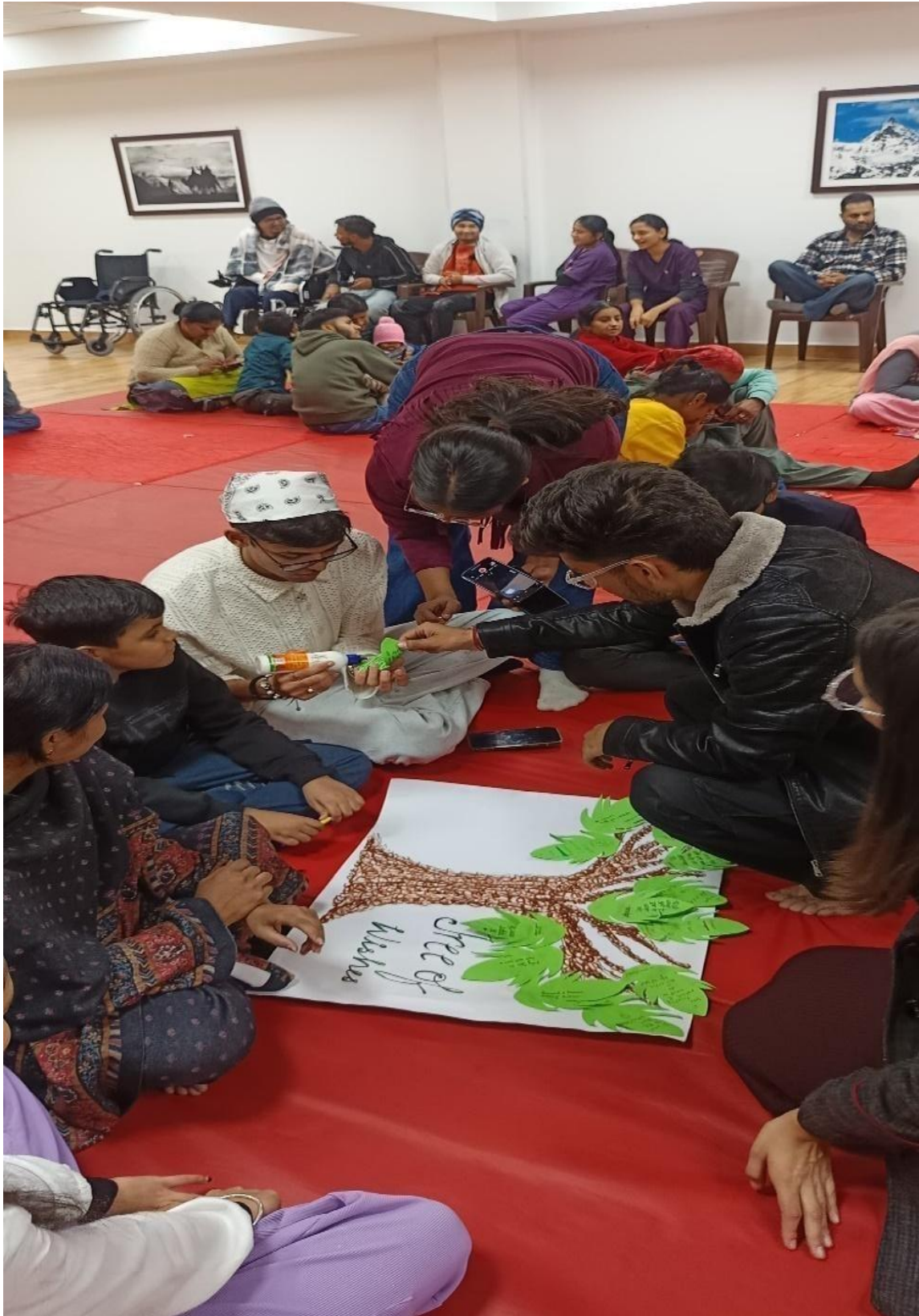
Volunteers making paintings with muscular dystrophy warriors