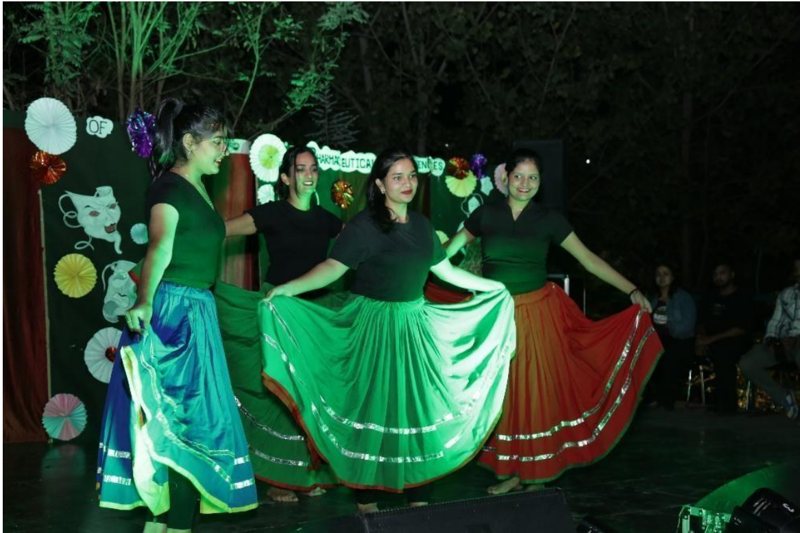
Students and faculty members presenting a cultural performance