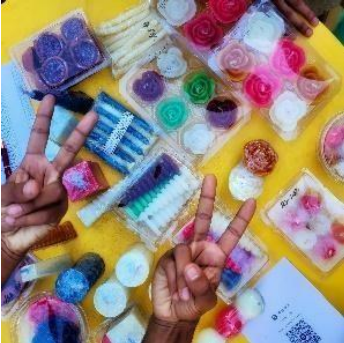
A photograph of the stall