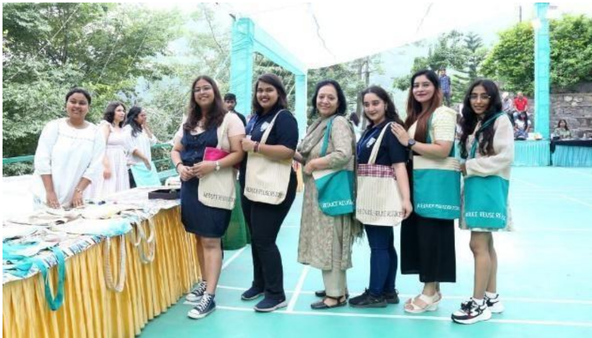
Girls and faculty members with Sustainable bags