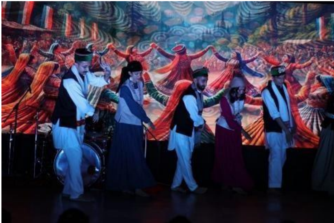
A Nati was presented by the students