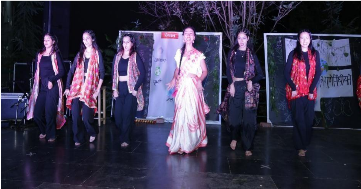
Students and faculty members presenting a cultural performance