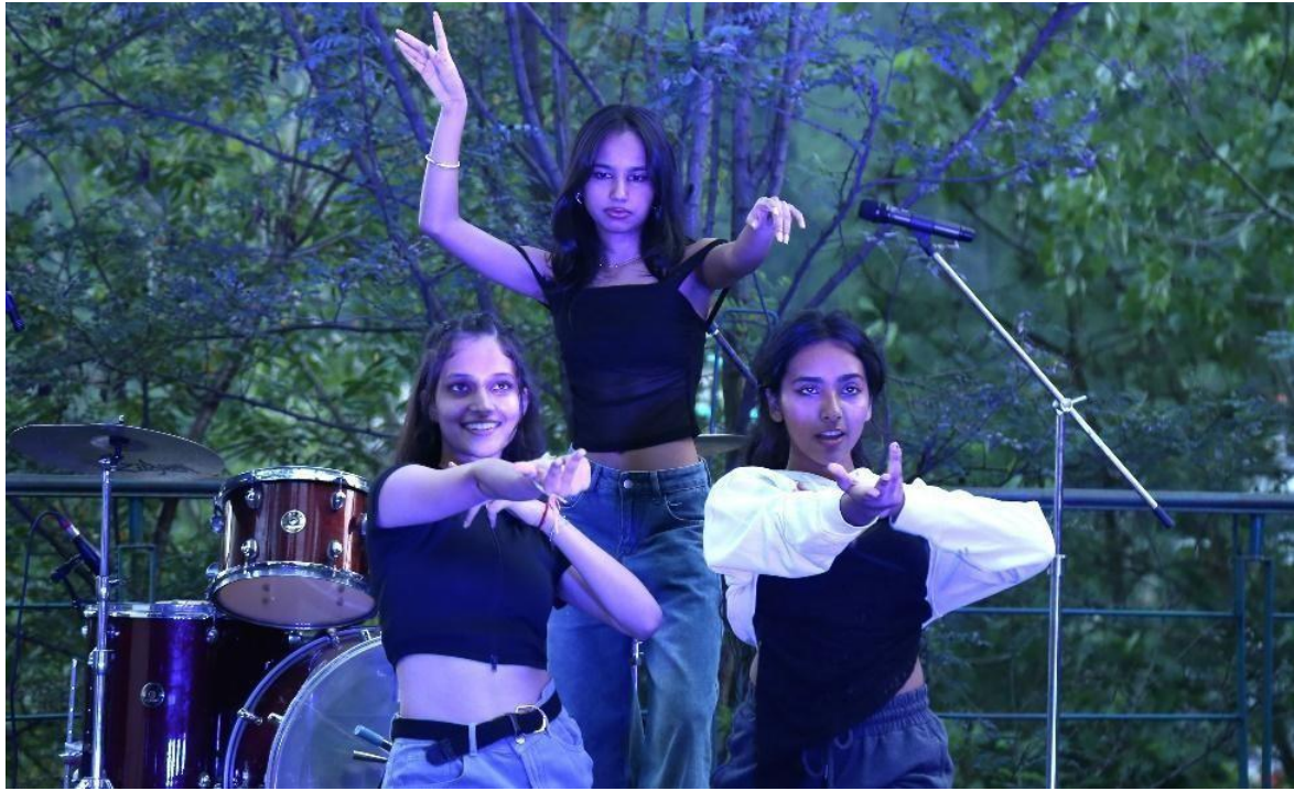
Girls presenting a Bollywood dance performance