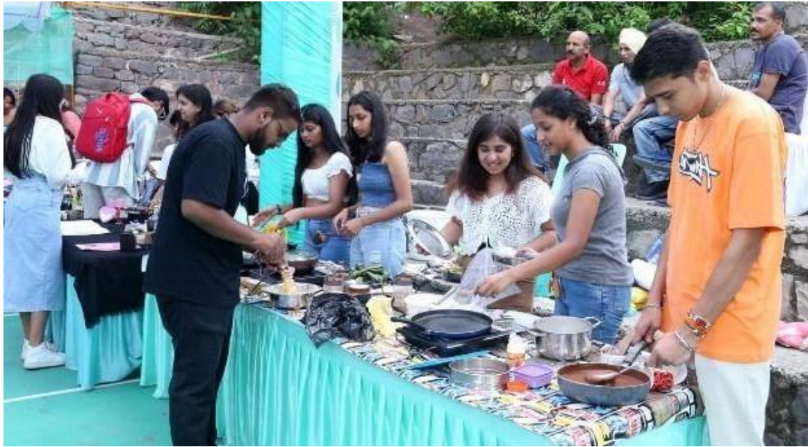
Food stalls were set up by the students