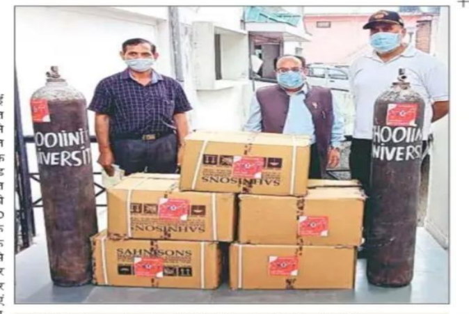
शूलिनी विश्वविद्यालय ने ग्रामीण क्षेत्रों में कोविड रोगियों के लिए दिए मैडीकल उपकरण।