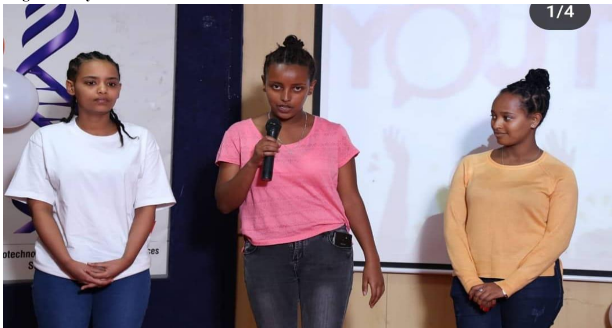
International Youth Day