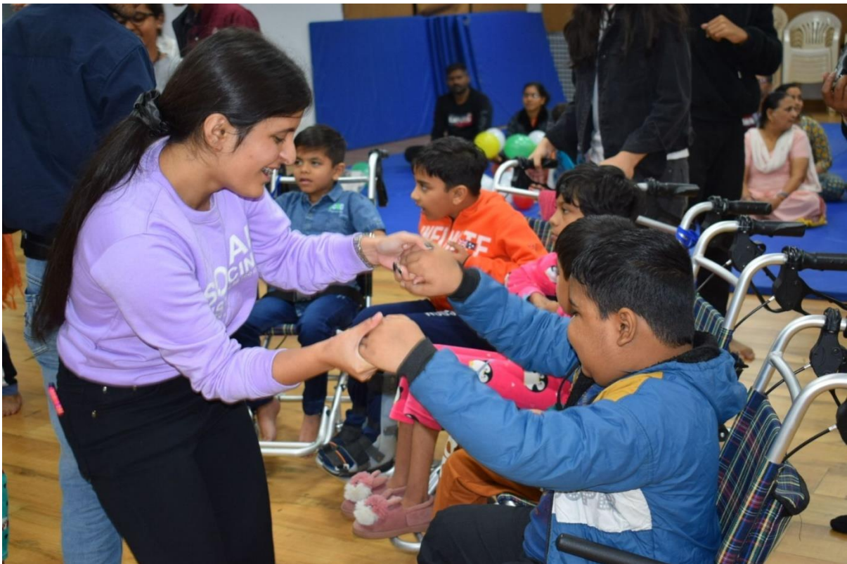
A volunteer dancing with a muscular dystrophy warrior