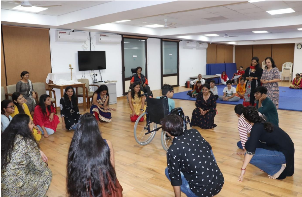
Volunteers and children enjoying Garba Dance