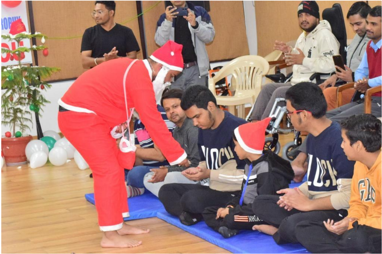
Santa distributing sweets