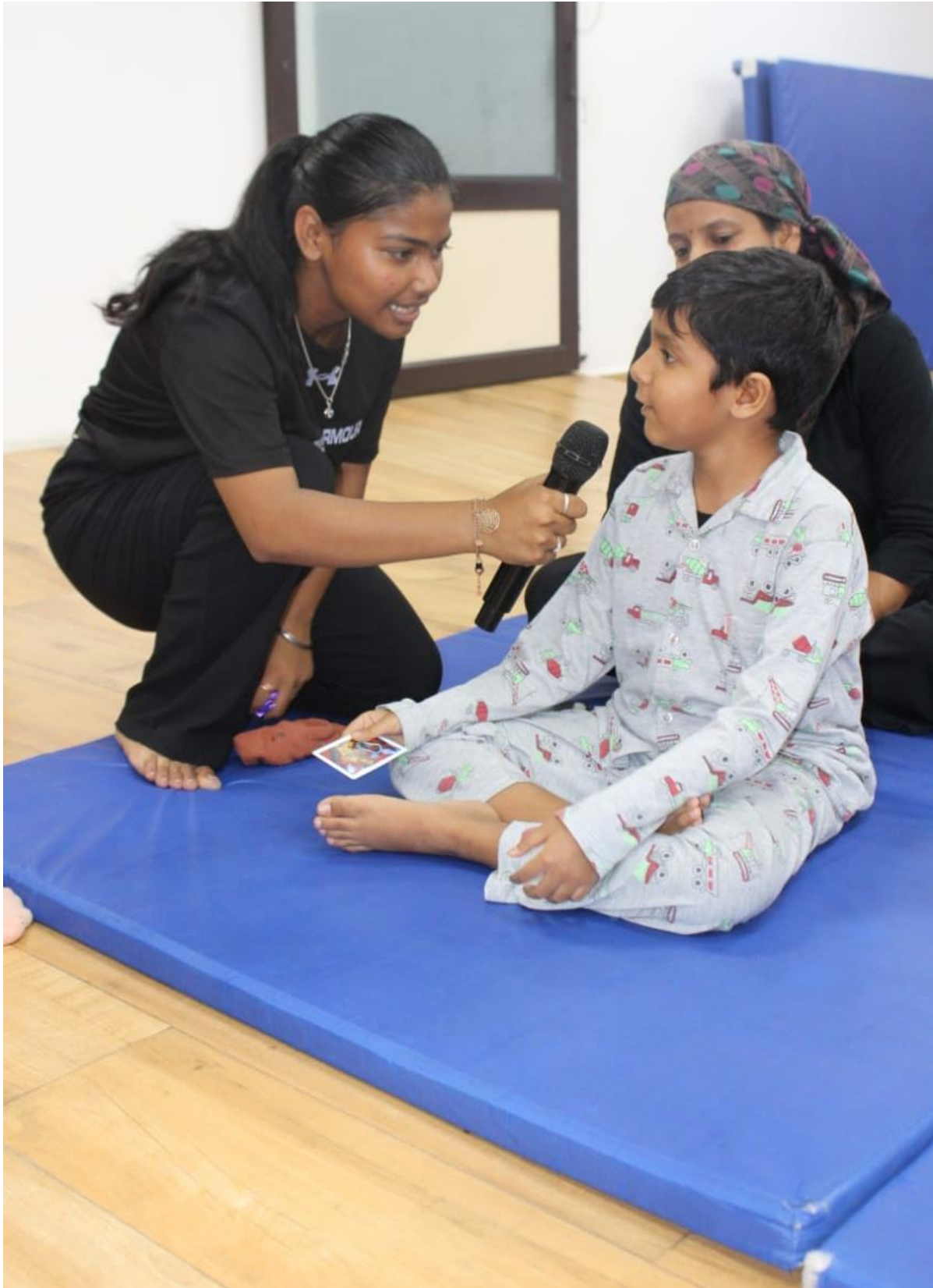
A muscular dystrophy warrior answering a question