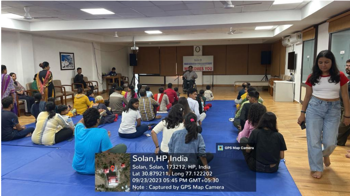
Muscular dystrophy warriors and their guardians participated in the event