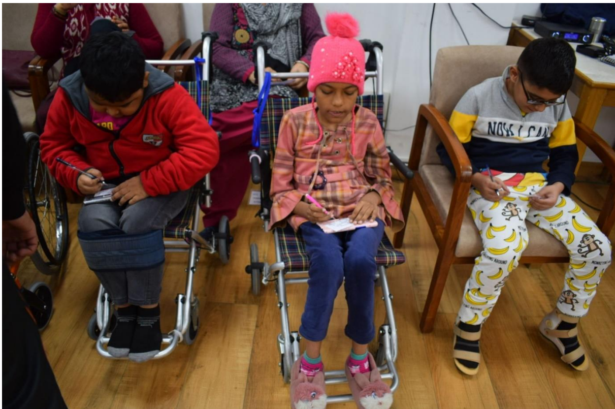
Children playing Tambola

Total number of students participated: - 24