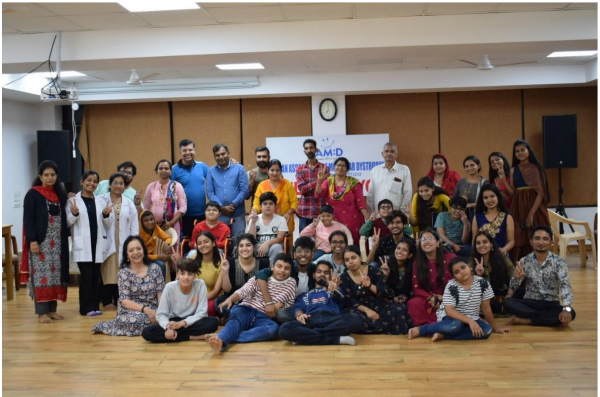
A group photograph of all the gathering present for cultural evening at Manav Mandir