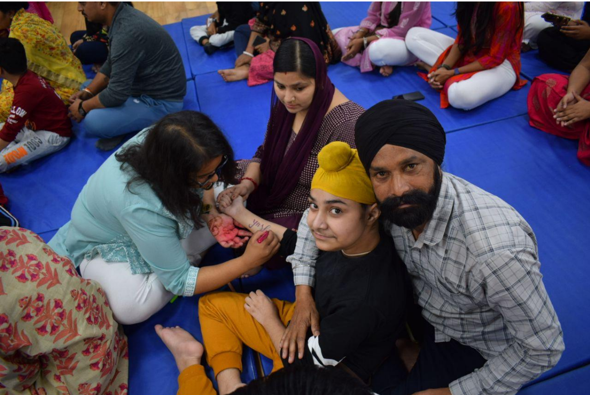
A photograph of a volunteer making tattoo