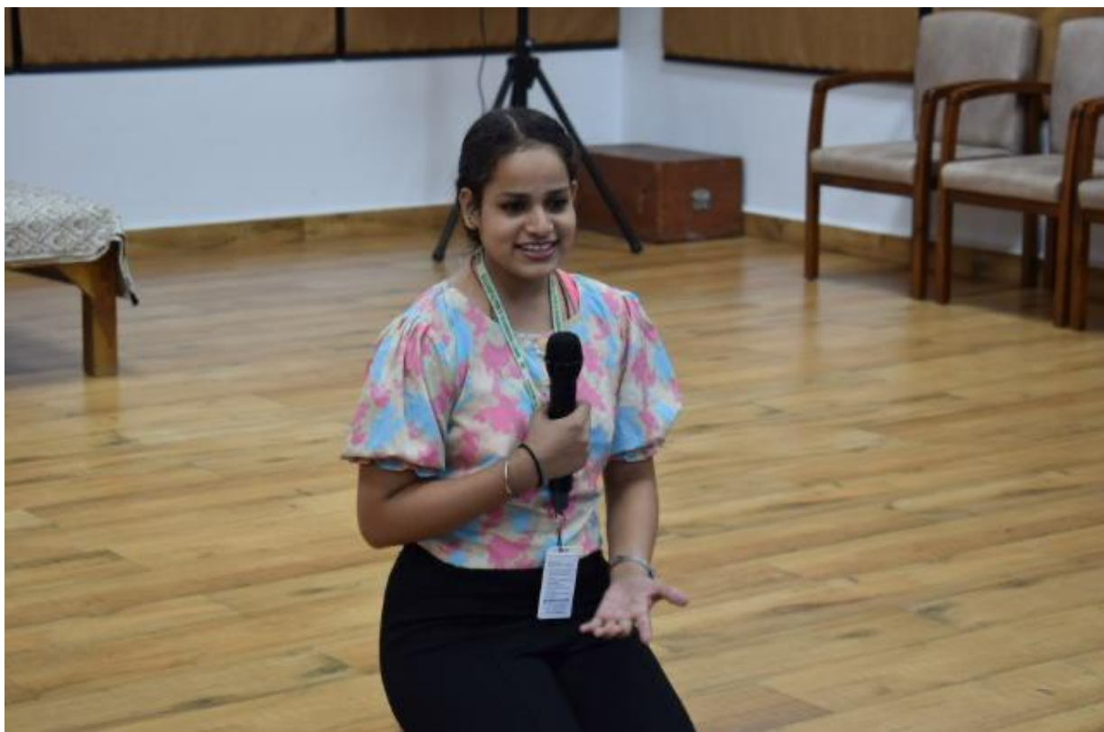
A volunteer sharing her experiences with muscular dystrophy warriors at IAMD