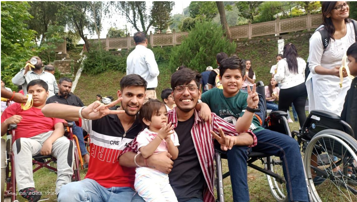
Volunteers and muscular dystrophy warriors playing with each other