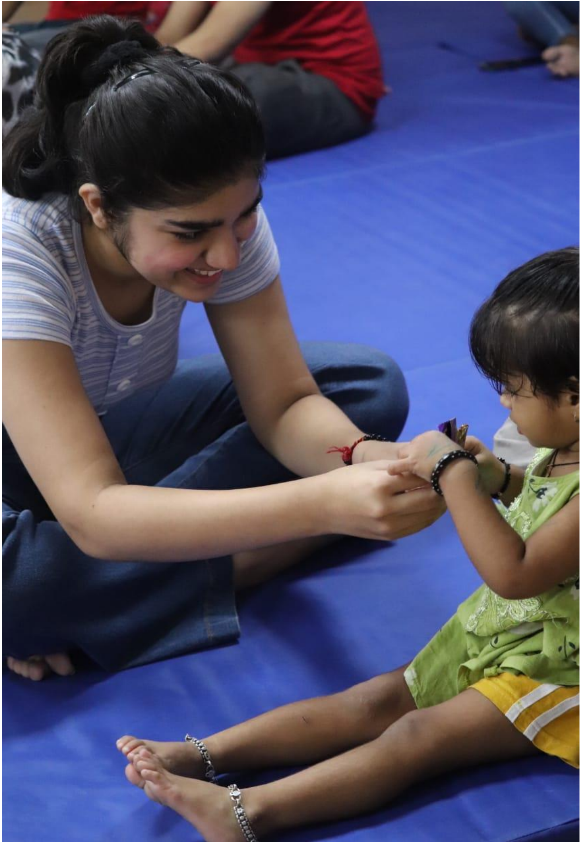
Shoolini volunteer giving chocolate to a kid at IAMD centre