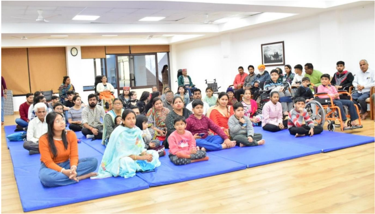
Muscular dystrophy warriors and their guardians enjoying the cultural evening