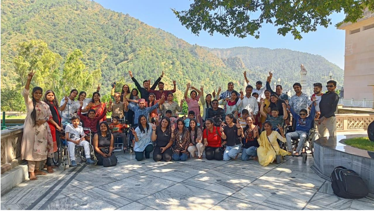
A group photograph of all the participants was captured in the temple area