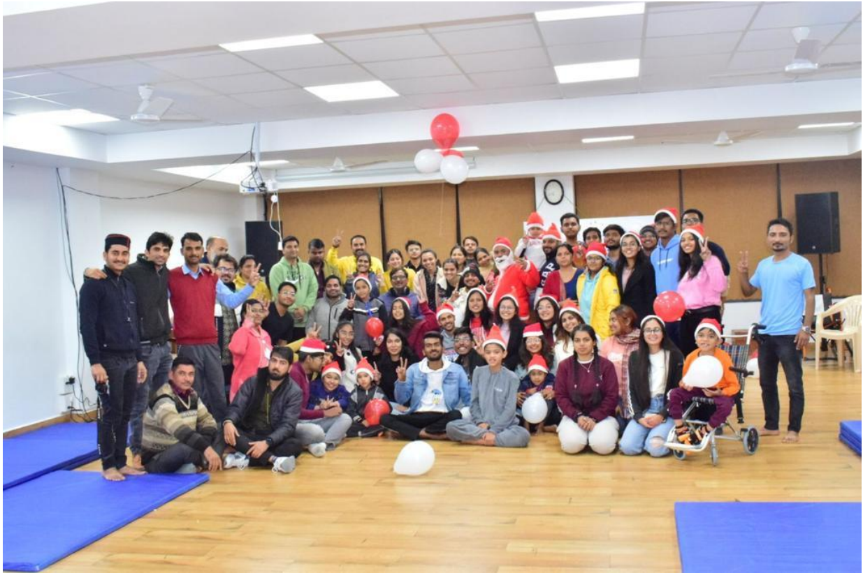
A group photograph captured at the end of the celebration