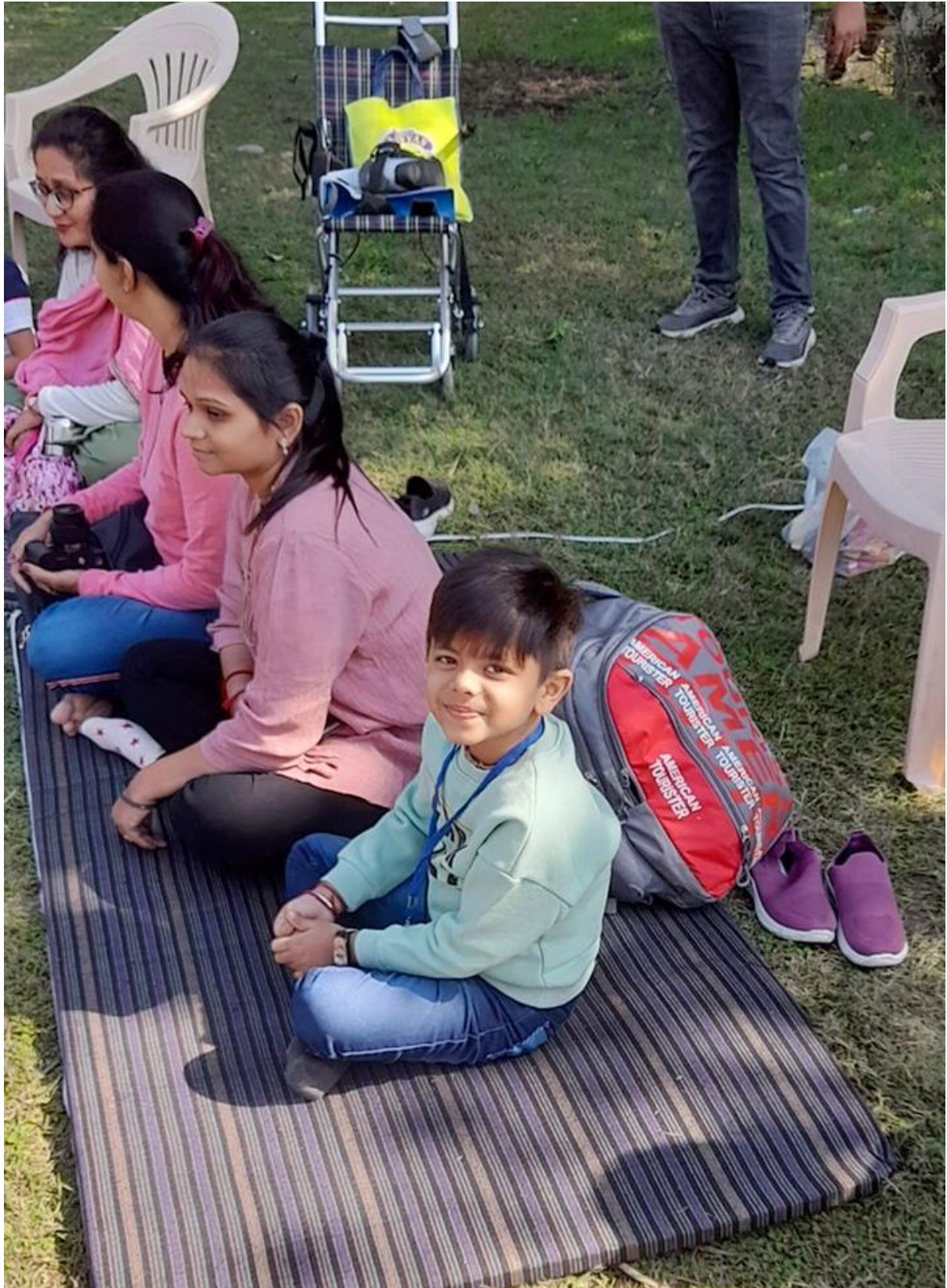
A photograph of a happy young child