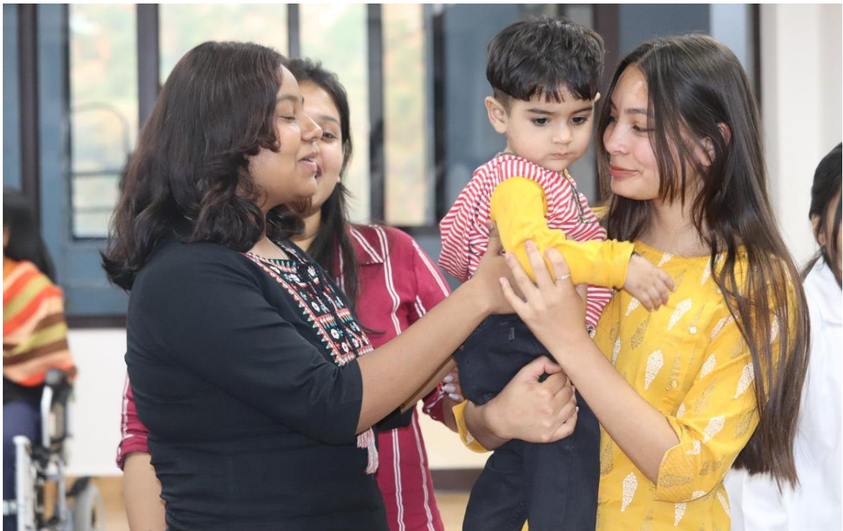
Volunteers interacting with a kid