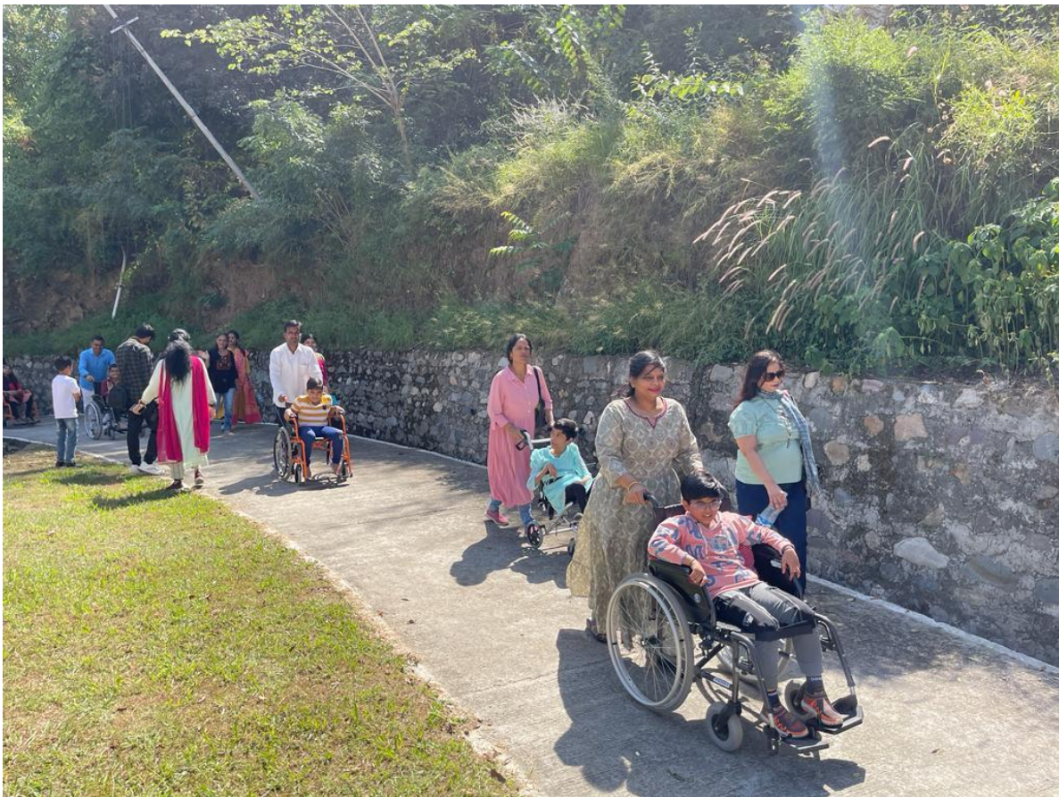
Volunteers escorting the Muscular Dystrophy Warriors towards temple area