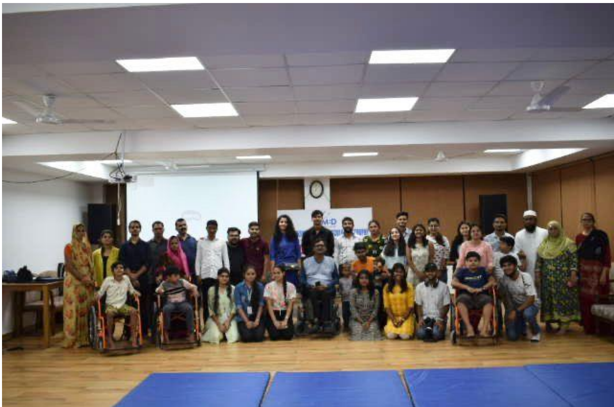
A group photograph of all the volunteers and participants at Manav Mandir