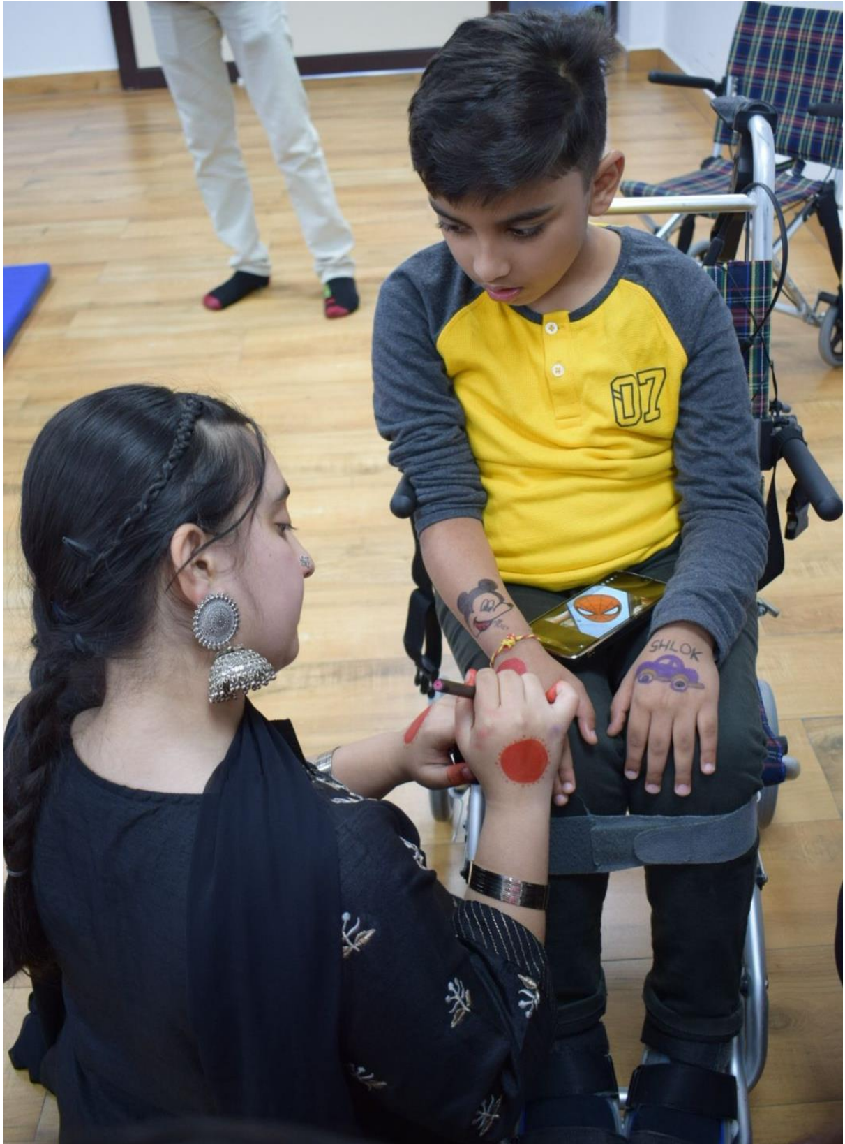
Volunteers Asavri making tattoo on hands of a child