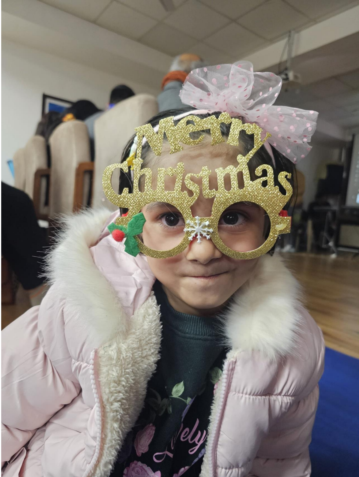
A little girl wearing Merry Christmas glasses props