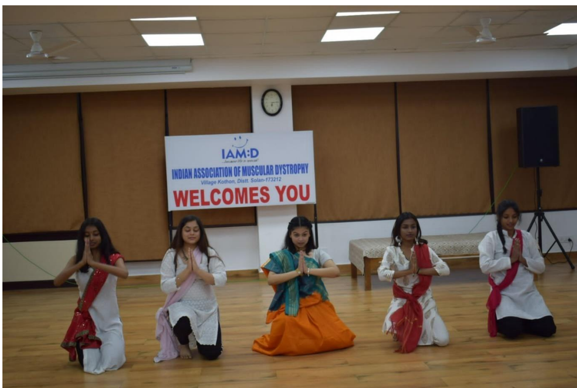
A classical dance being presented by volunteers

Total number of students participated: - 24