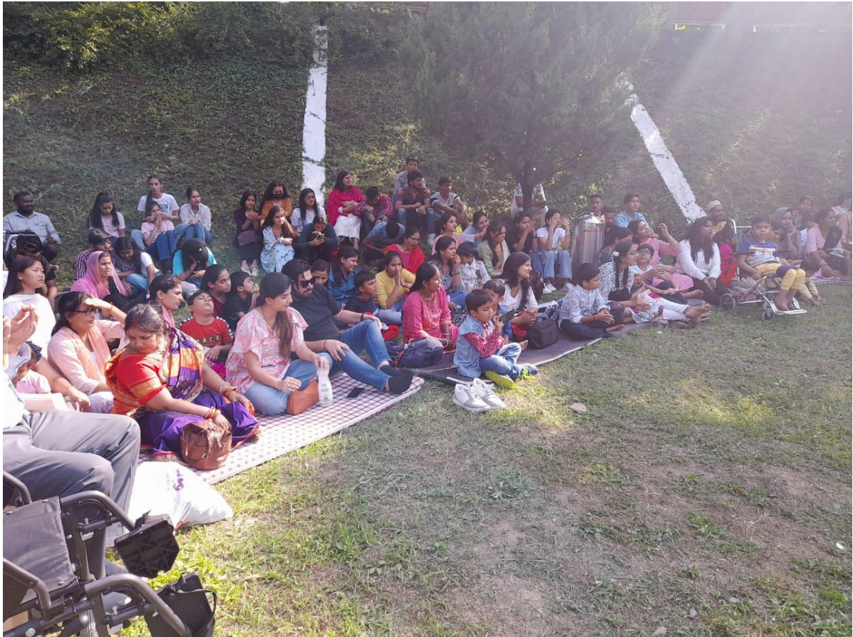
A photograph of all the participants