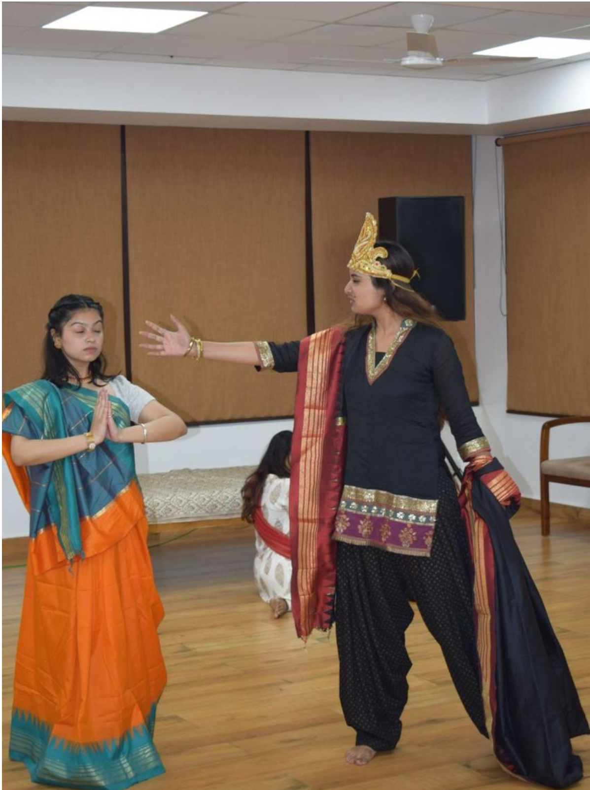
A dialogue taking place between Ravana & Sita