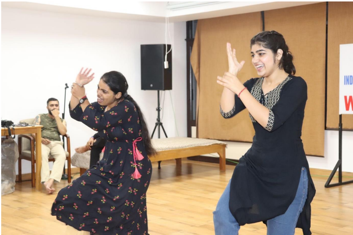
Two of the volunteers presenting a dance performance