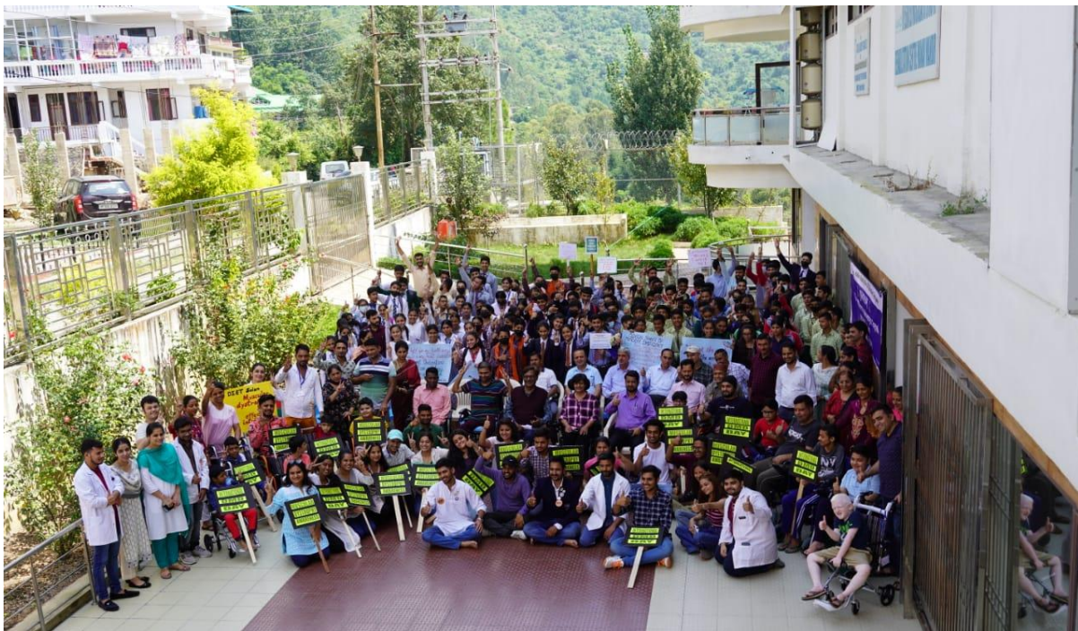
A photograph of the students and all the invited members at IAMD centre