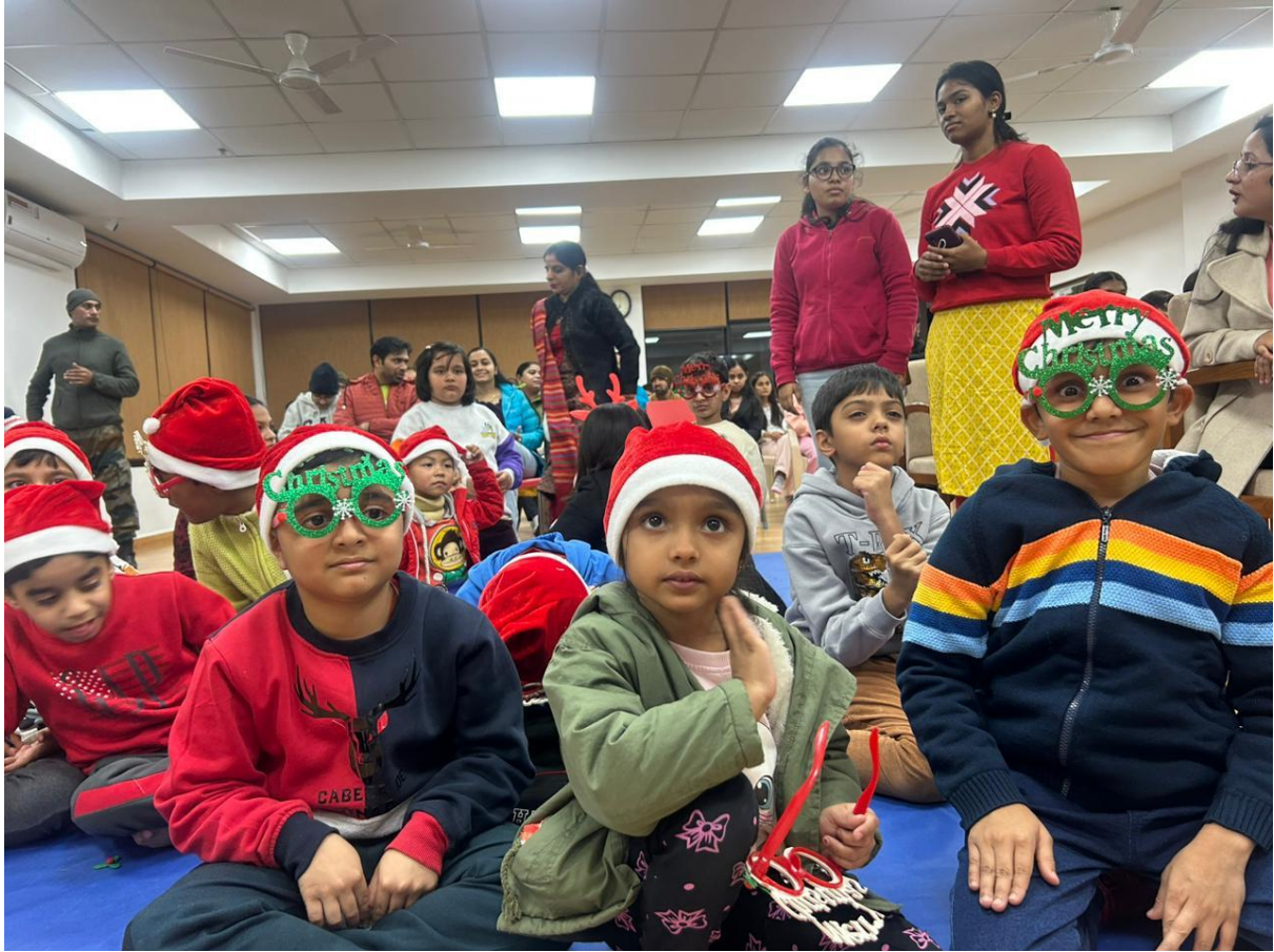
Children were very excited for the celebration.