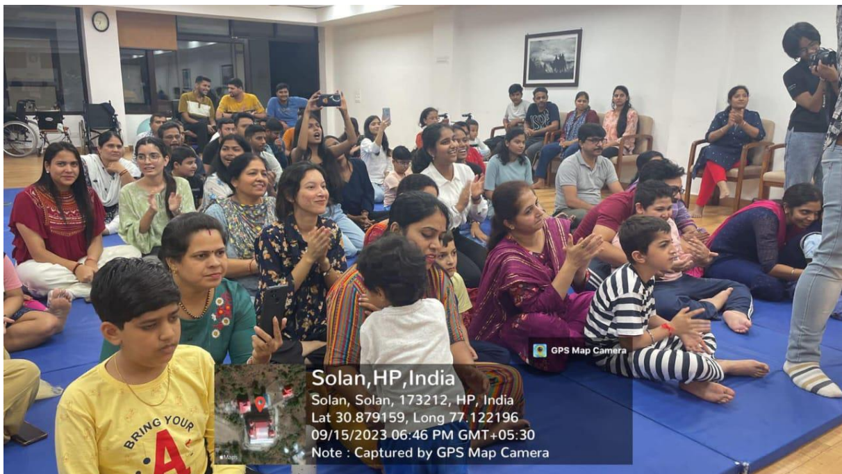
Everyone at IAMD Centre enjoyed the show