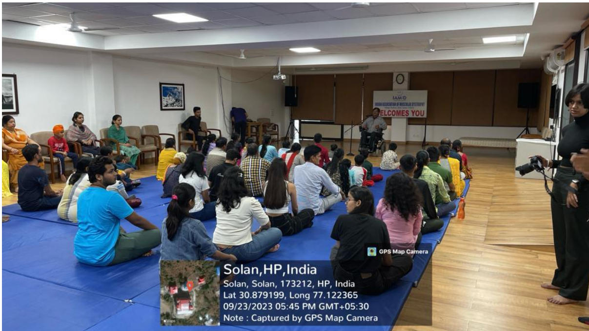
Everyone at Manav Mandir enjoyed the evening