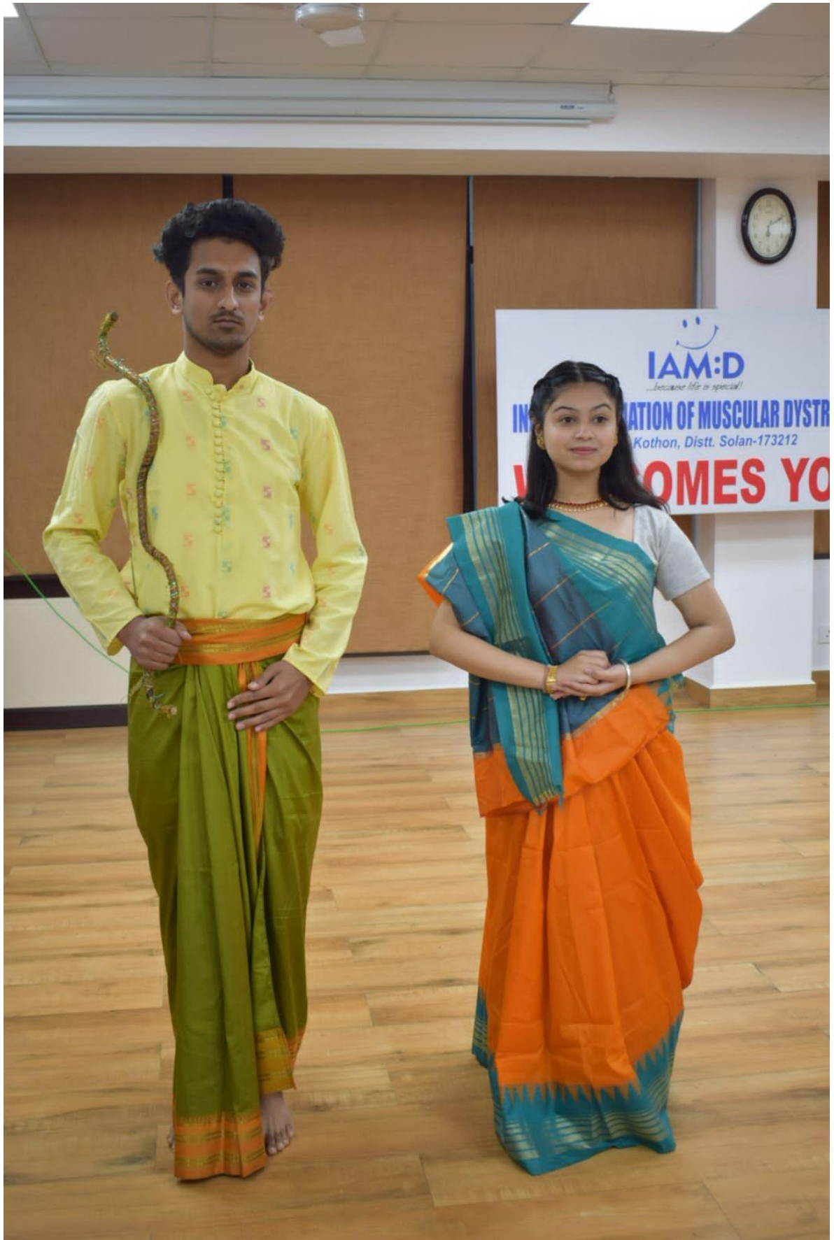
Volunteers in the role of Lord Rama & Devi Sita