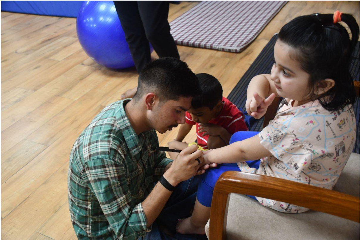
A volunteer making a tattoo on the hand of a muscular dystrophy warrior