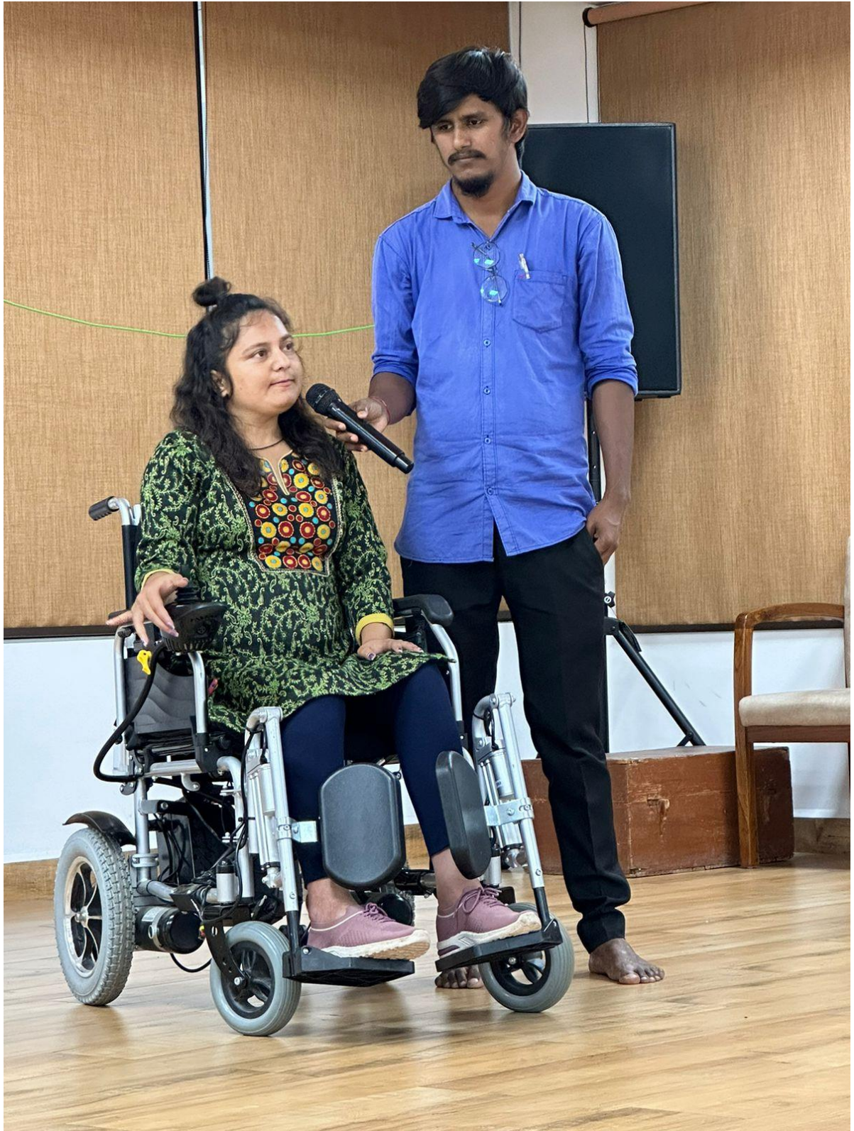
A muscular dystrophy warrior sharing her life story