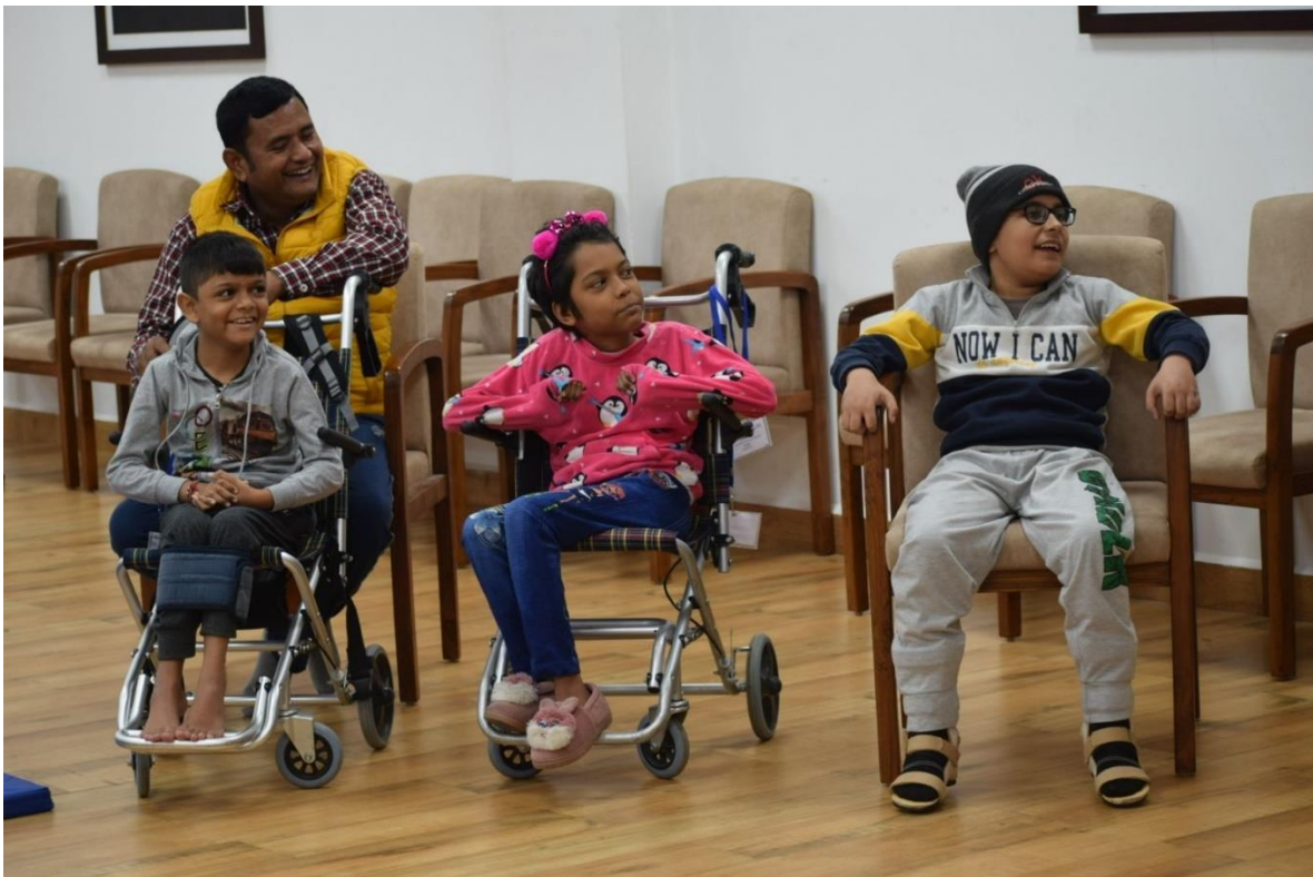
Children enjoying a dance being performed on the stage