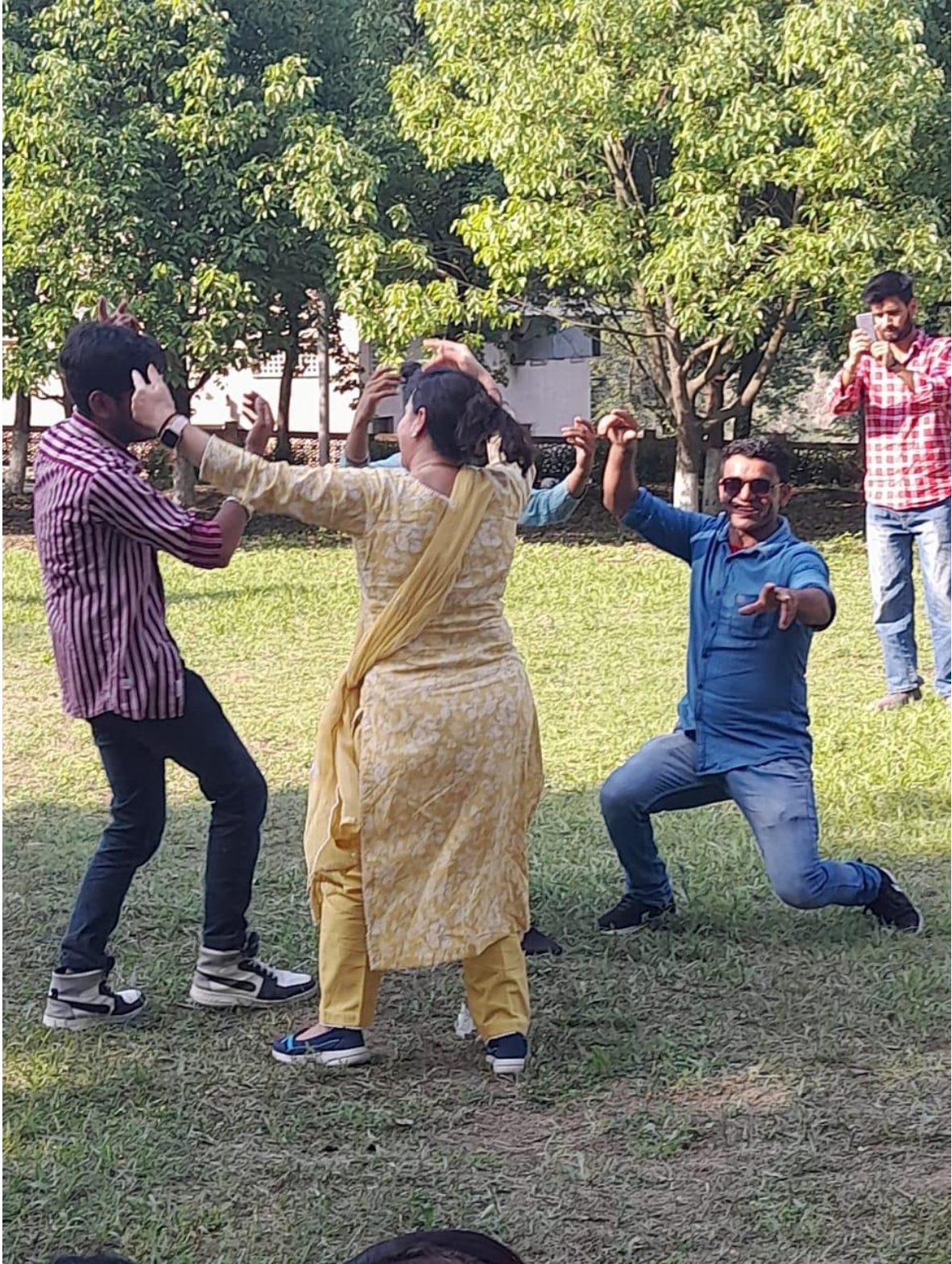
Participants dancing on Nati beats