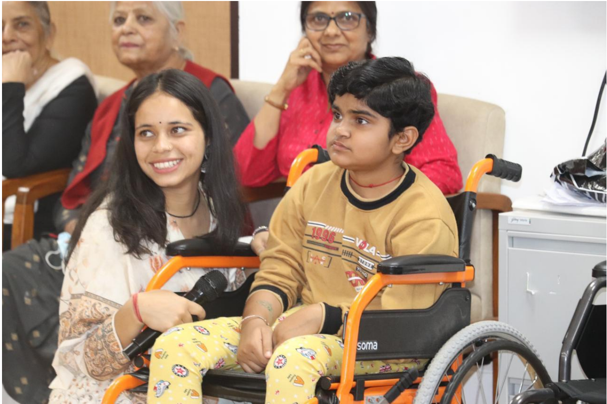
A muscular dystrophy warrior enjoying the show