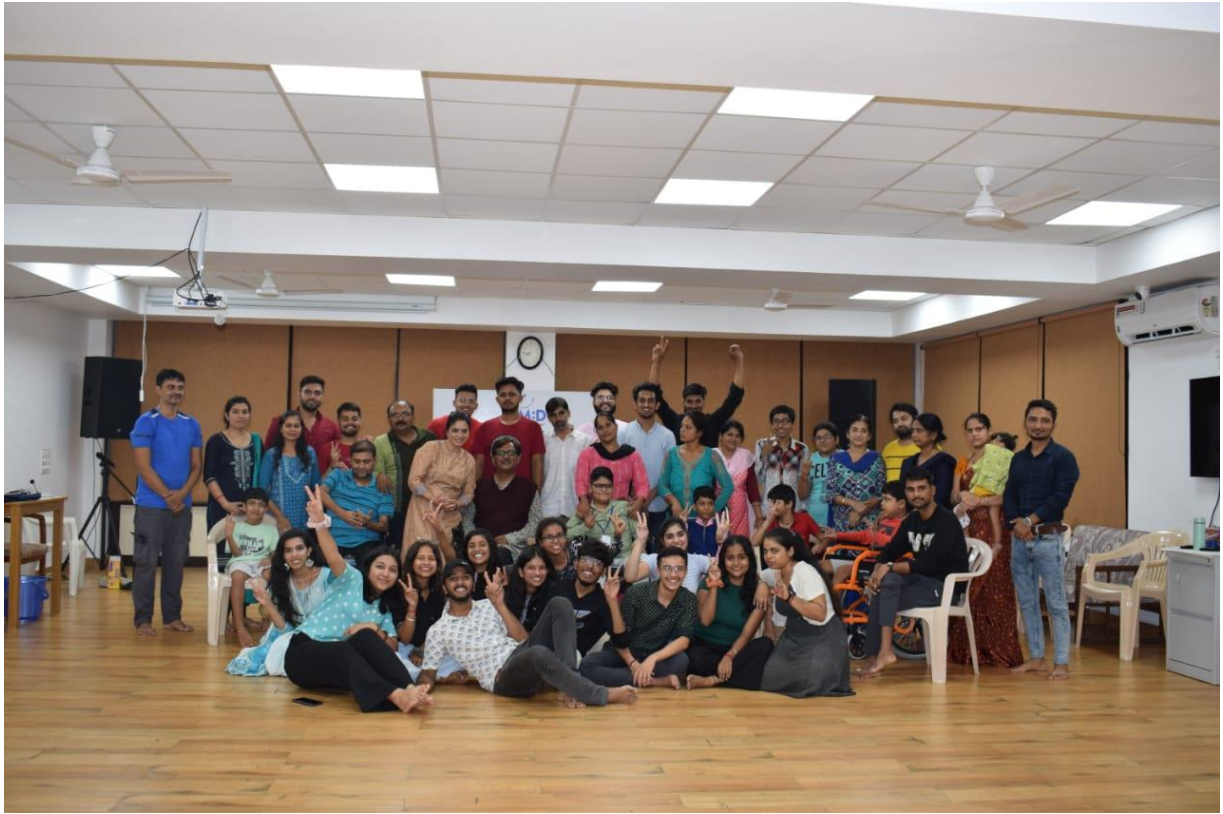
A group photograph captured at the closing of the cultural evening