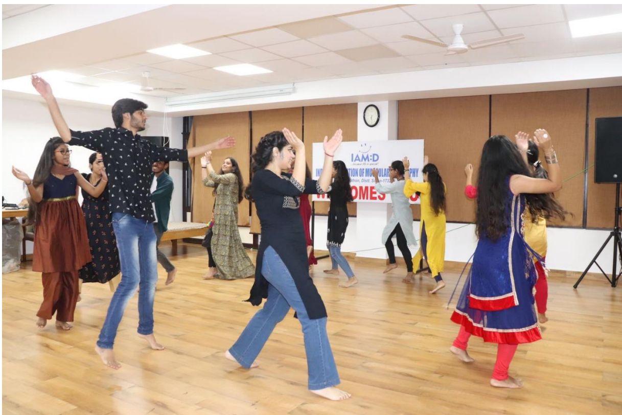
Volunteers from Shoolini University presenting a Garba Dance