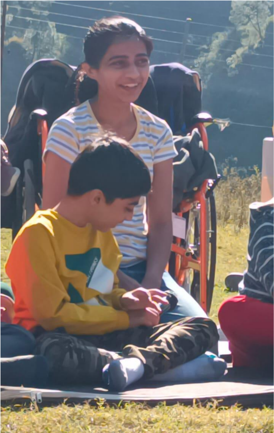
A random photograph of a child & volunteer