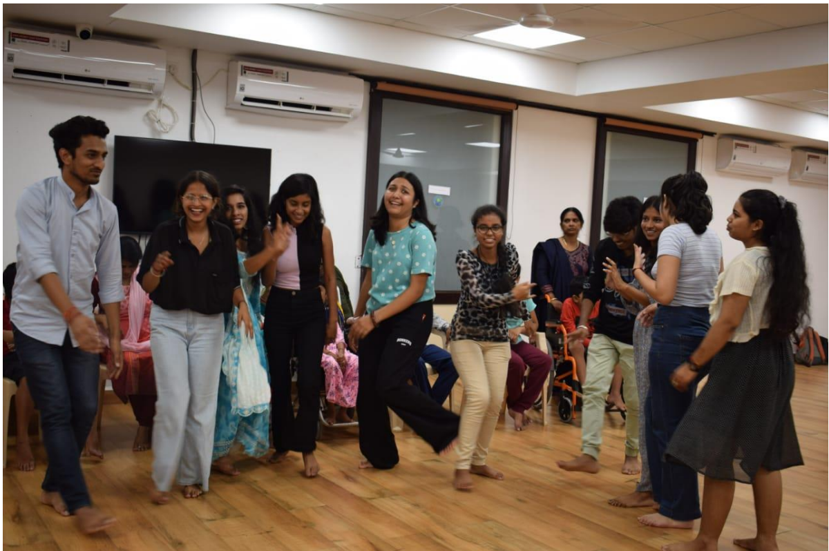
A photograph of volunteers captured during a game