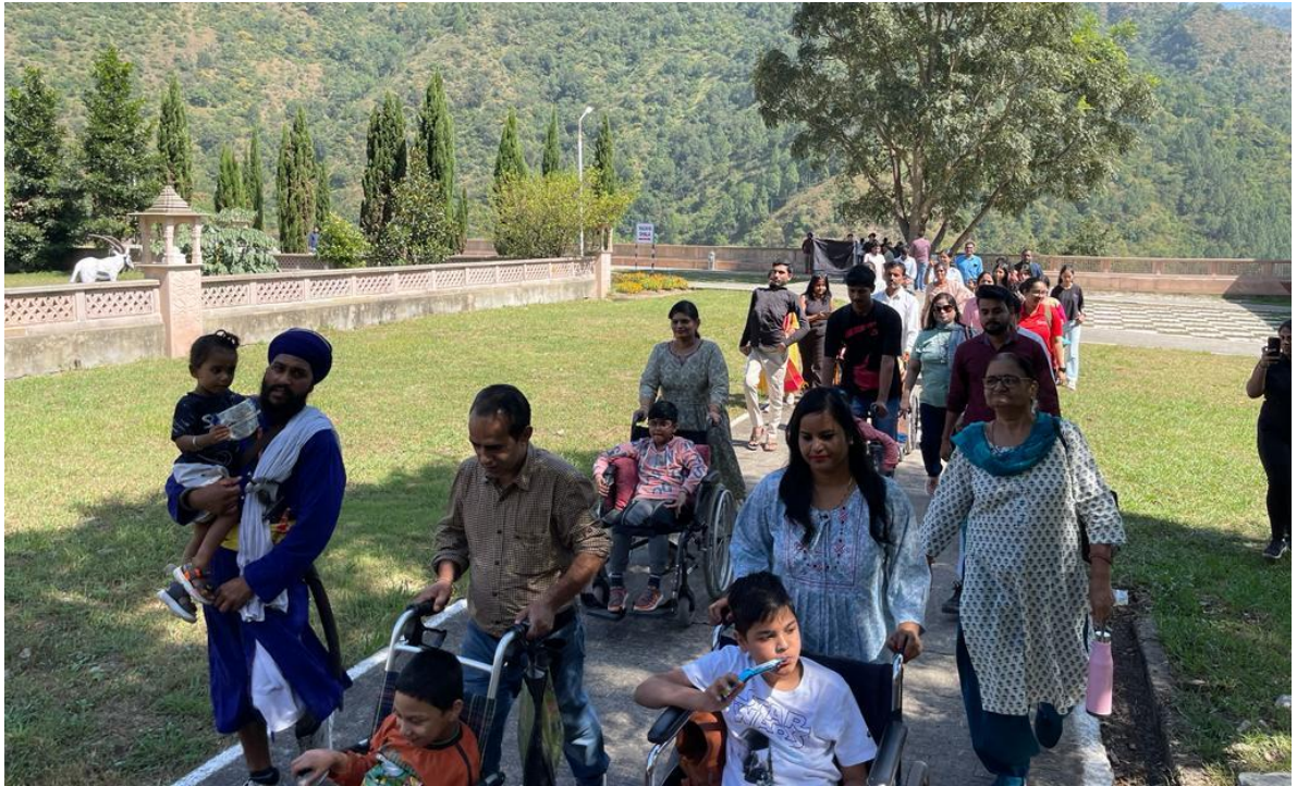
Everyone reached temple area and it made them very happy