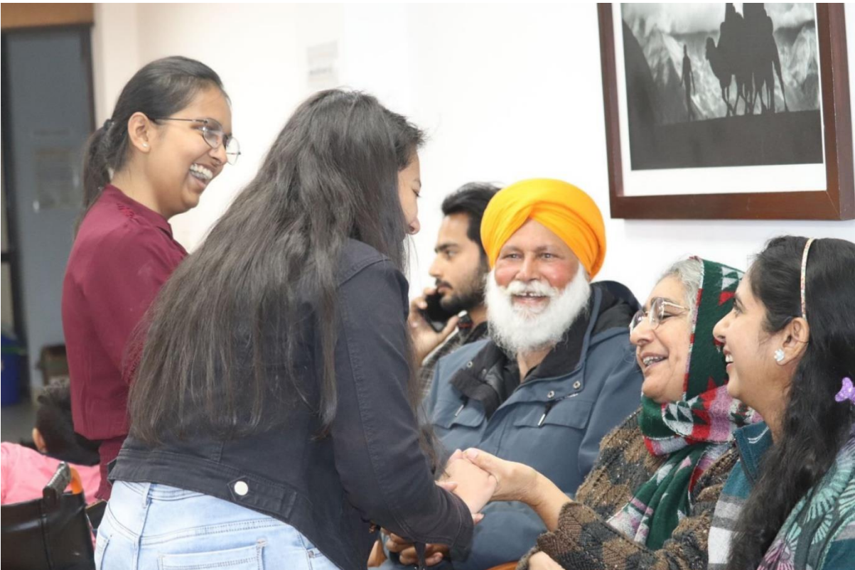
Volunteers talking to the guardians of Muscular Dystrophy Warriors