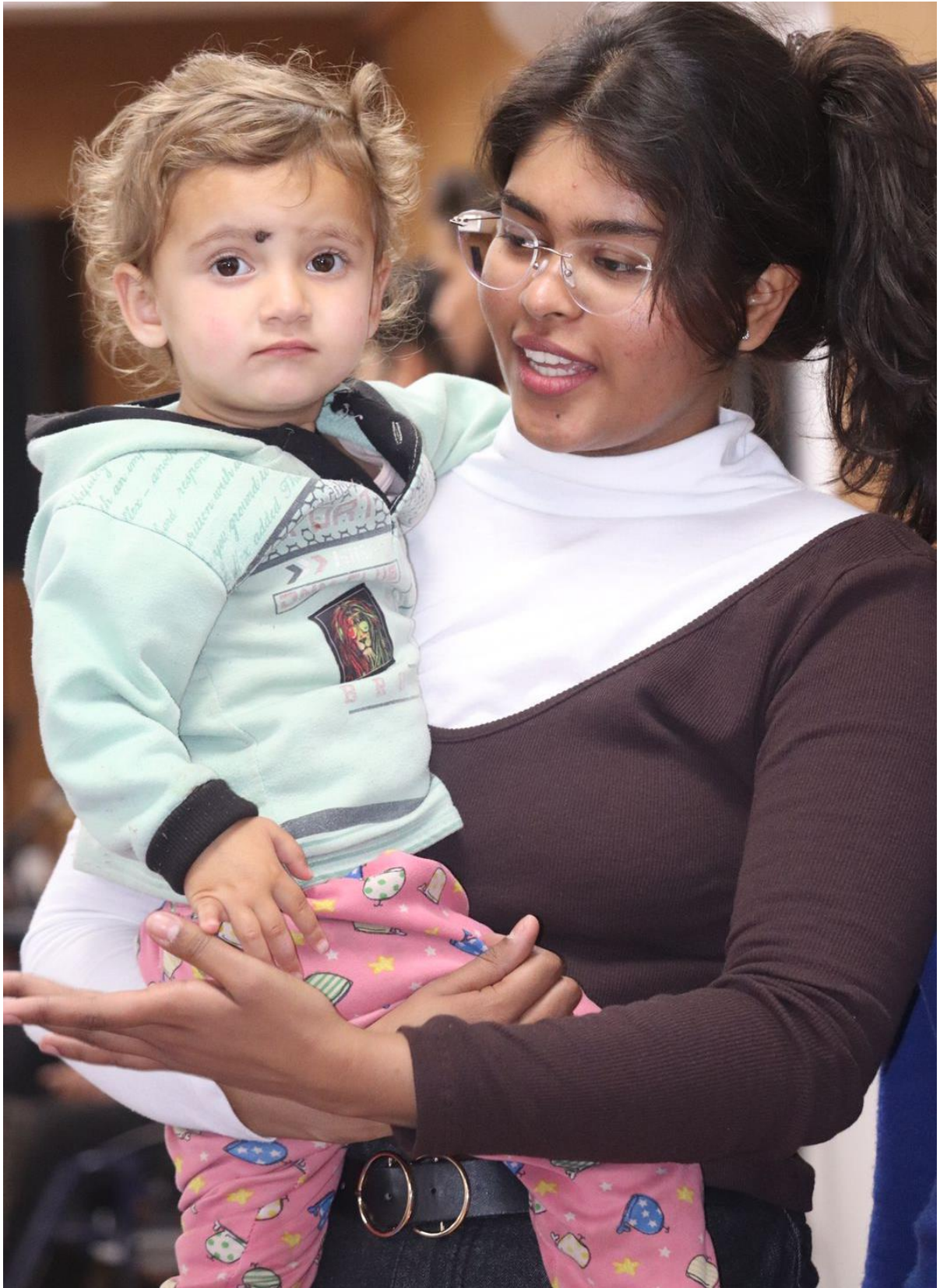
A volunteer with a child