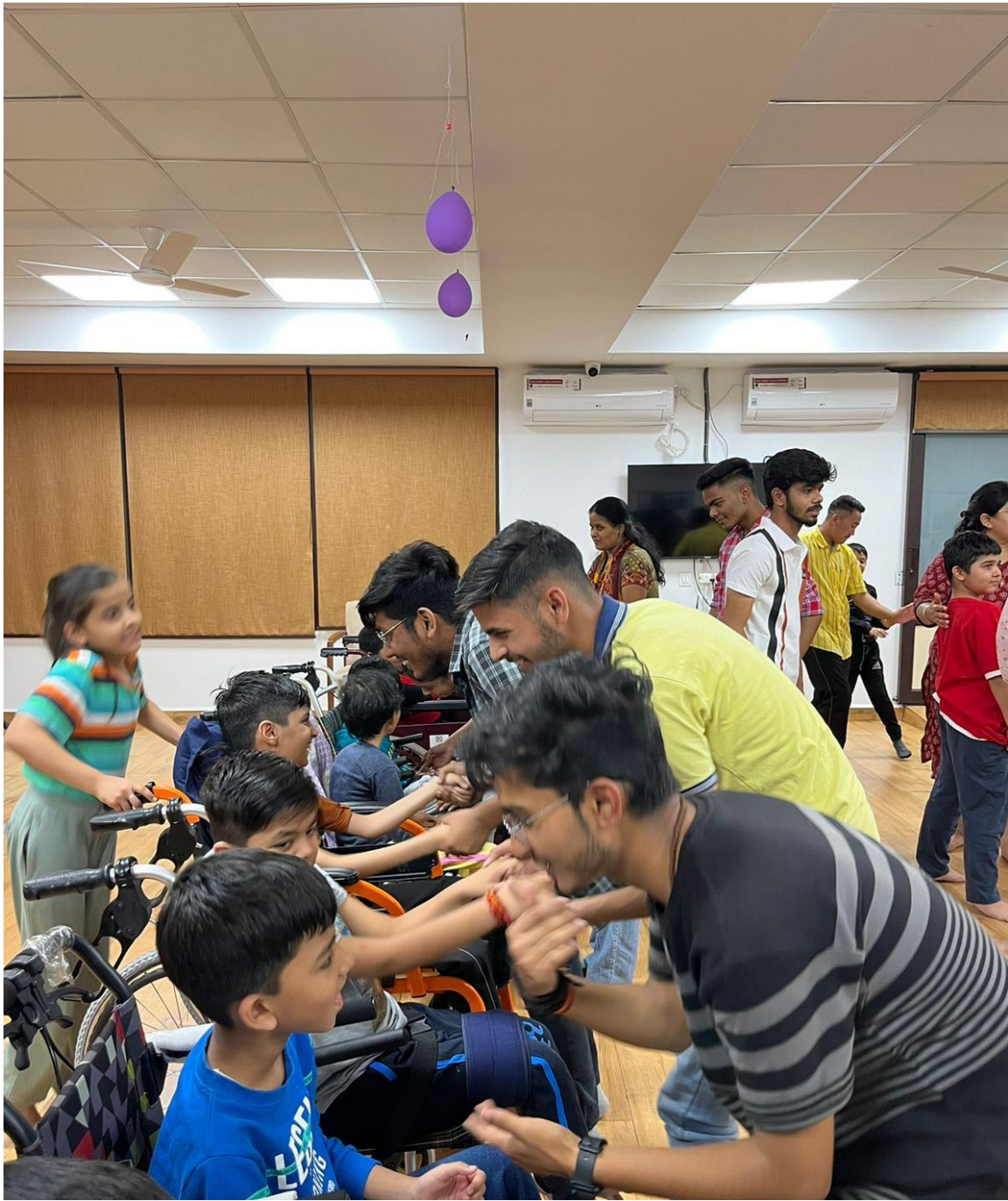
A fun activity being played