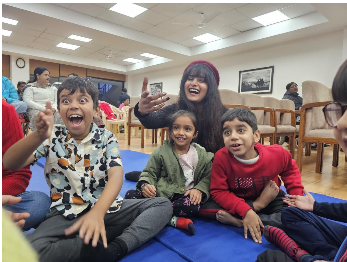
Volunteers and children laughing on an act of stand-up comedy

Total number of students participated: - 14