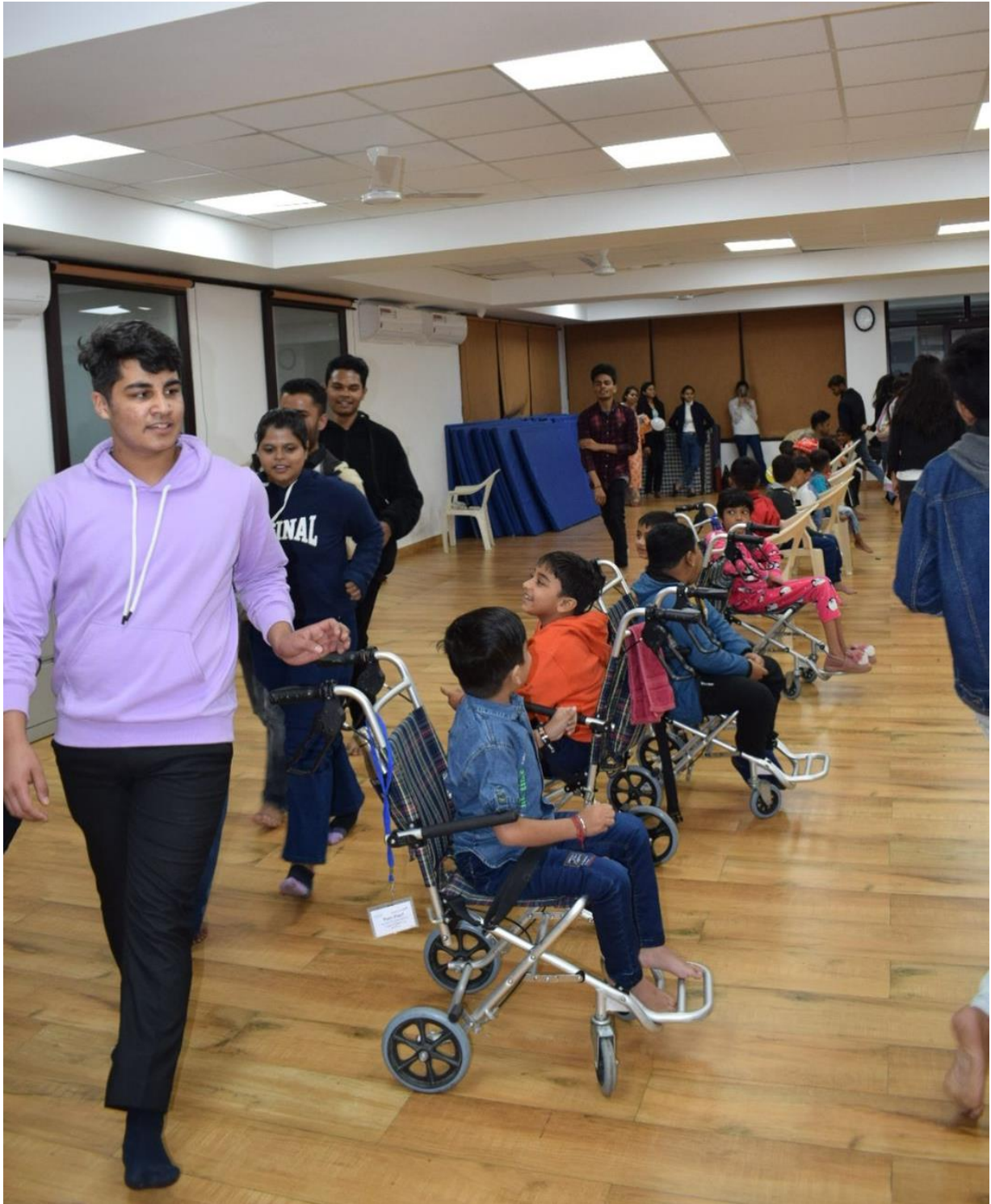
Musical chair game going on