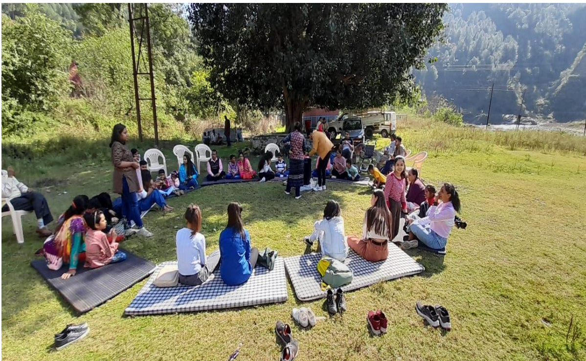
A beautiful view of the venue

Total number of students participated: - 12