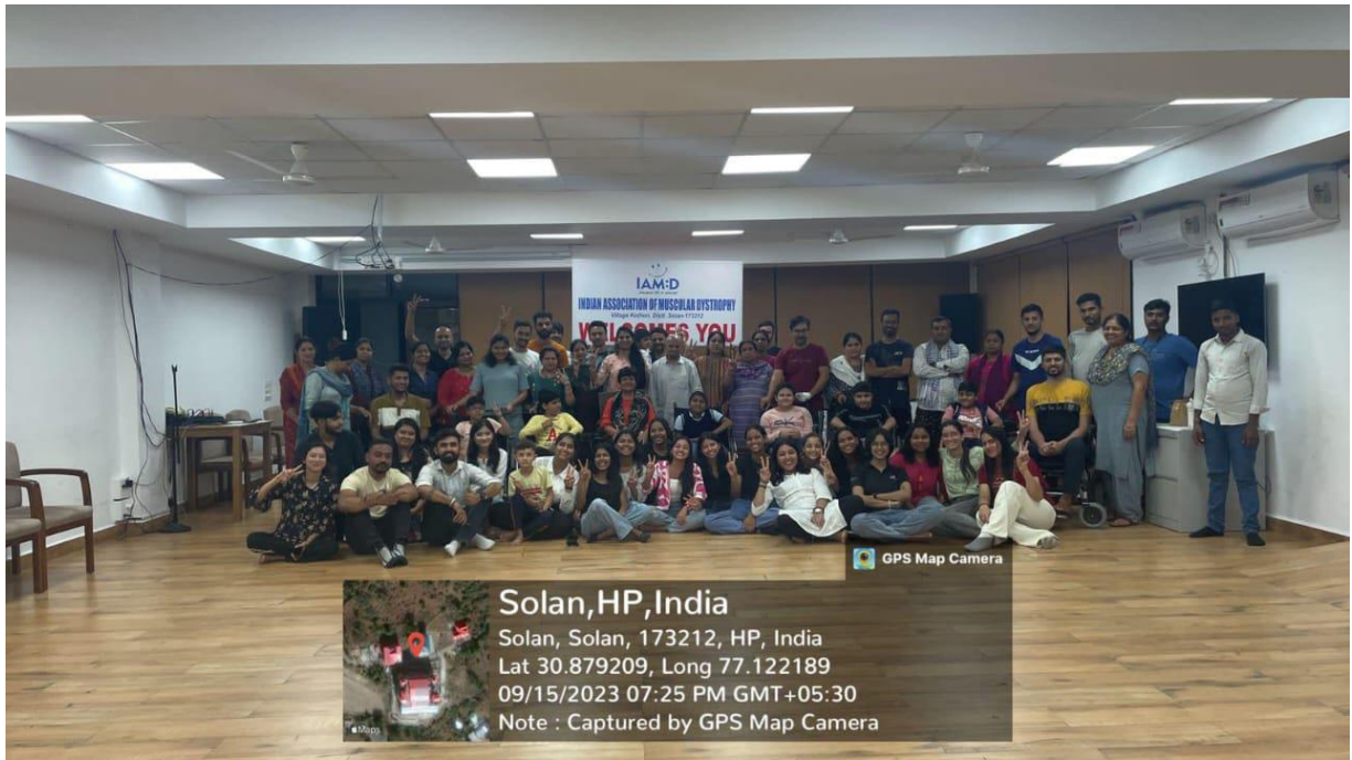
A group photograph of all the participants