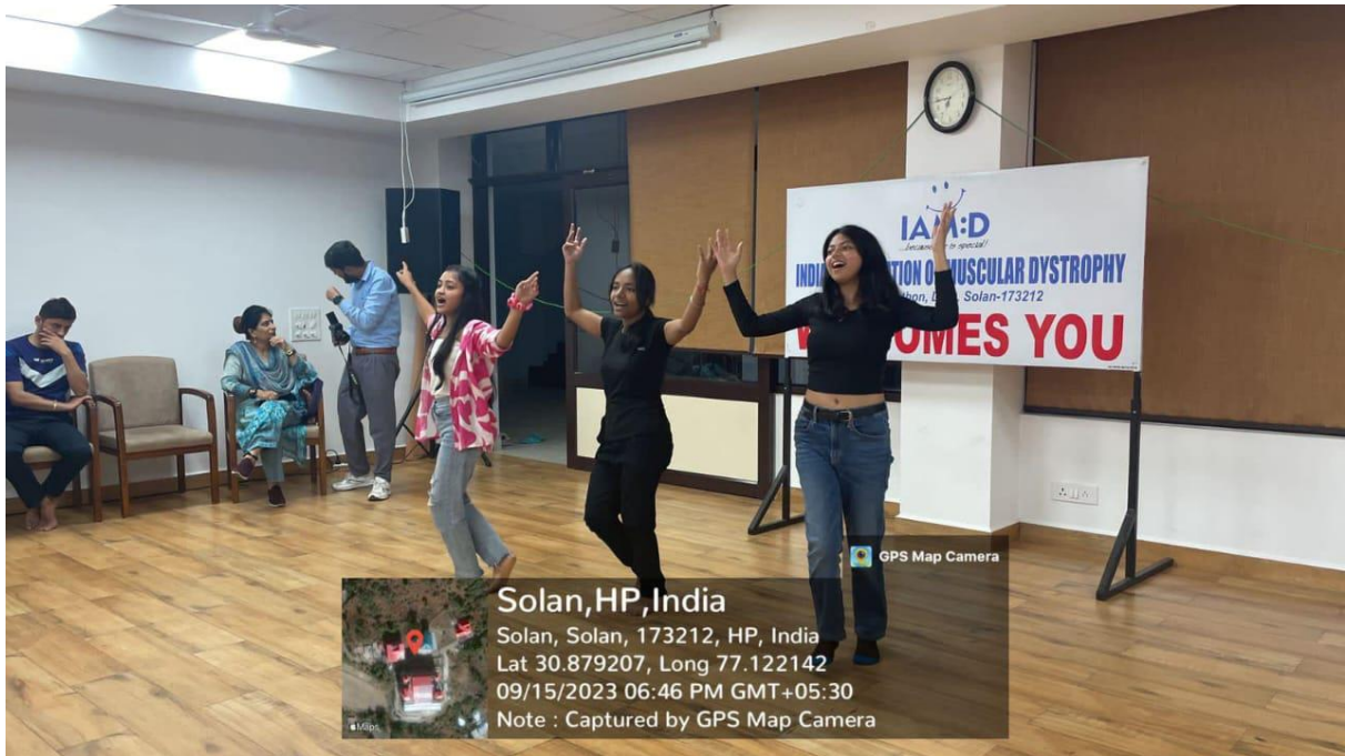
Some girls dancing on the stage