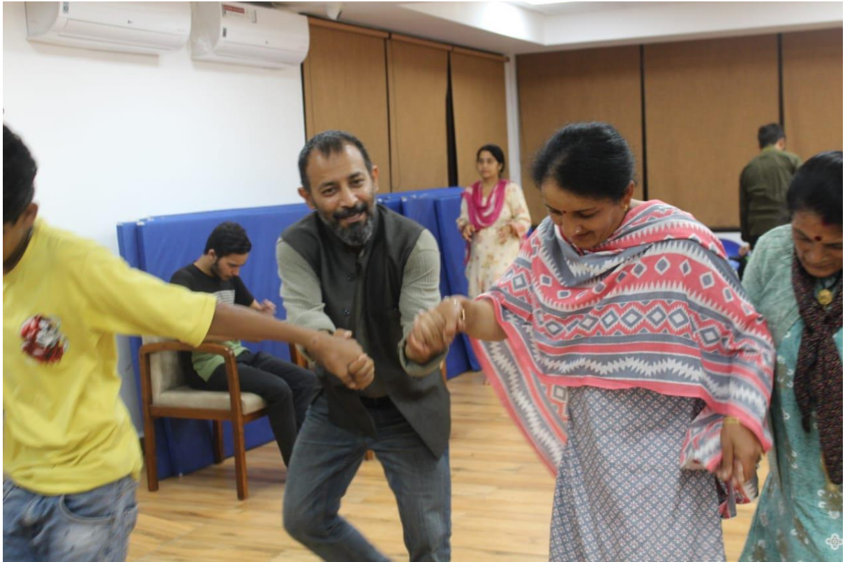
Everyone had a group dance at the end