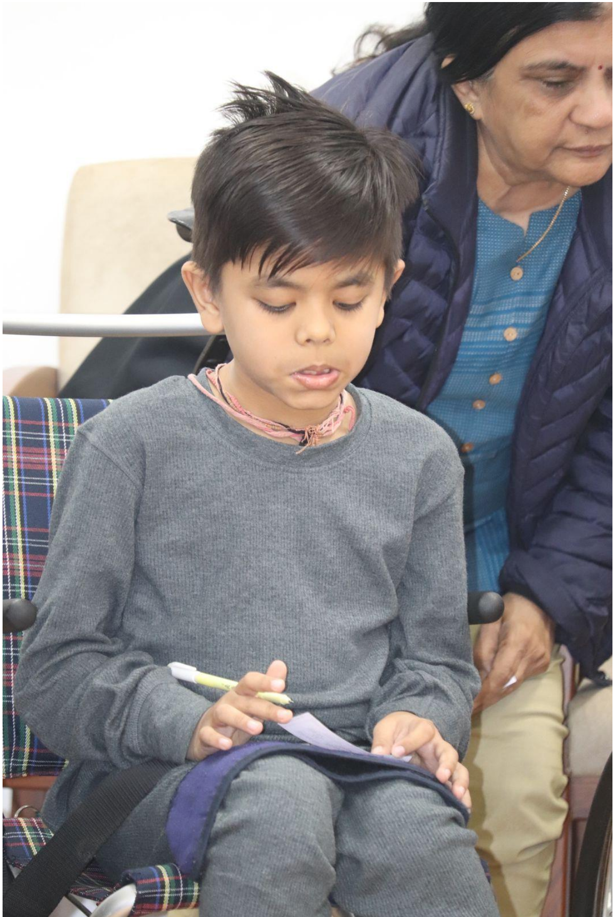
A muscular dystrophy warrior with his guardian