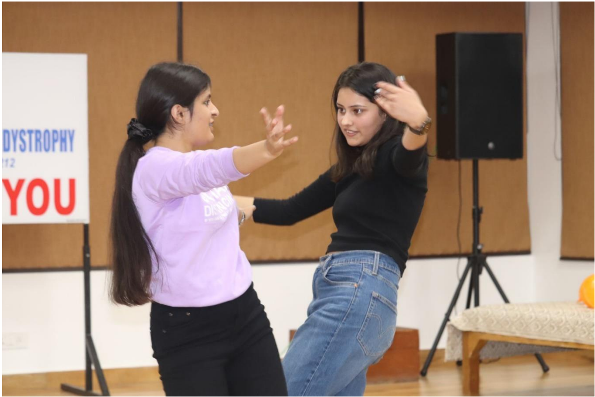
Volunteers presenting a dance