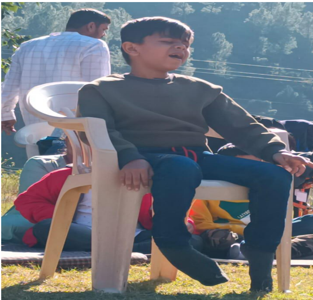
A muscular dystrophy warrior singing

Total number of students participated: - 11