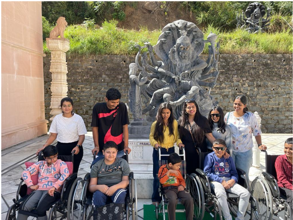
Volunteers and Muscular Dystrophy Warriors near Bhagwan Narsingh Idol