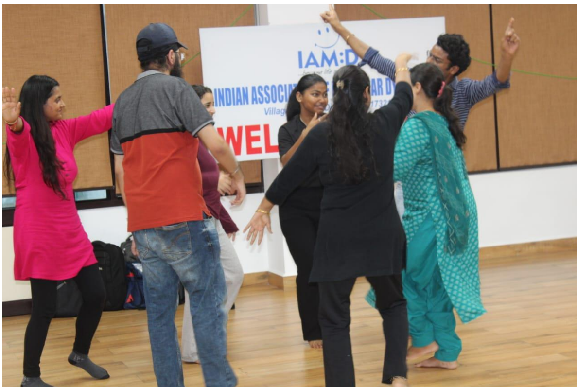
Volunteers and guardians of muscular dystrophy warriors dancing

Total number of students participated: - 18