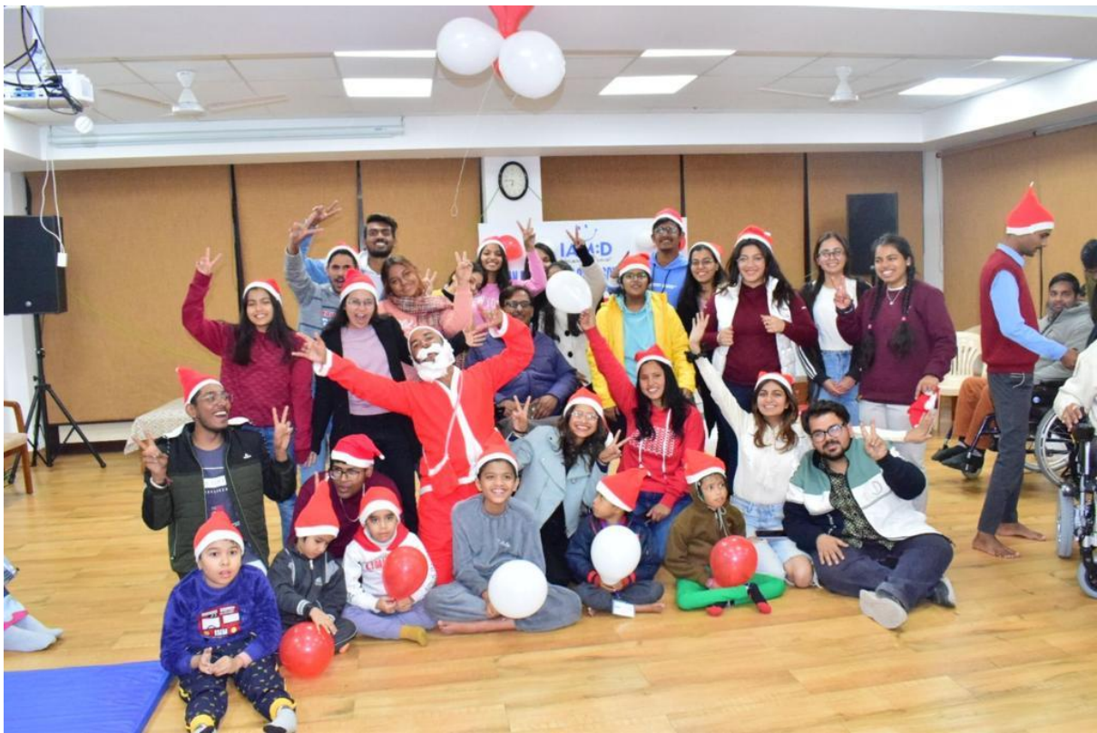
A photograph of volunteers and muscular dystrophy warriors