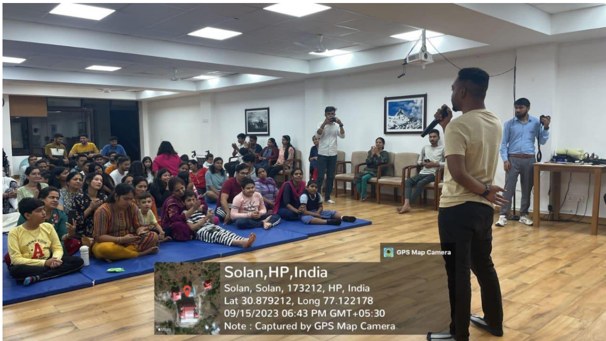
A volunteer anchoring the cultural evening

Total number of students participated: - 24