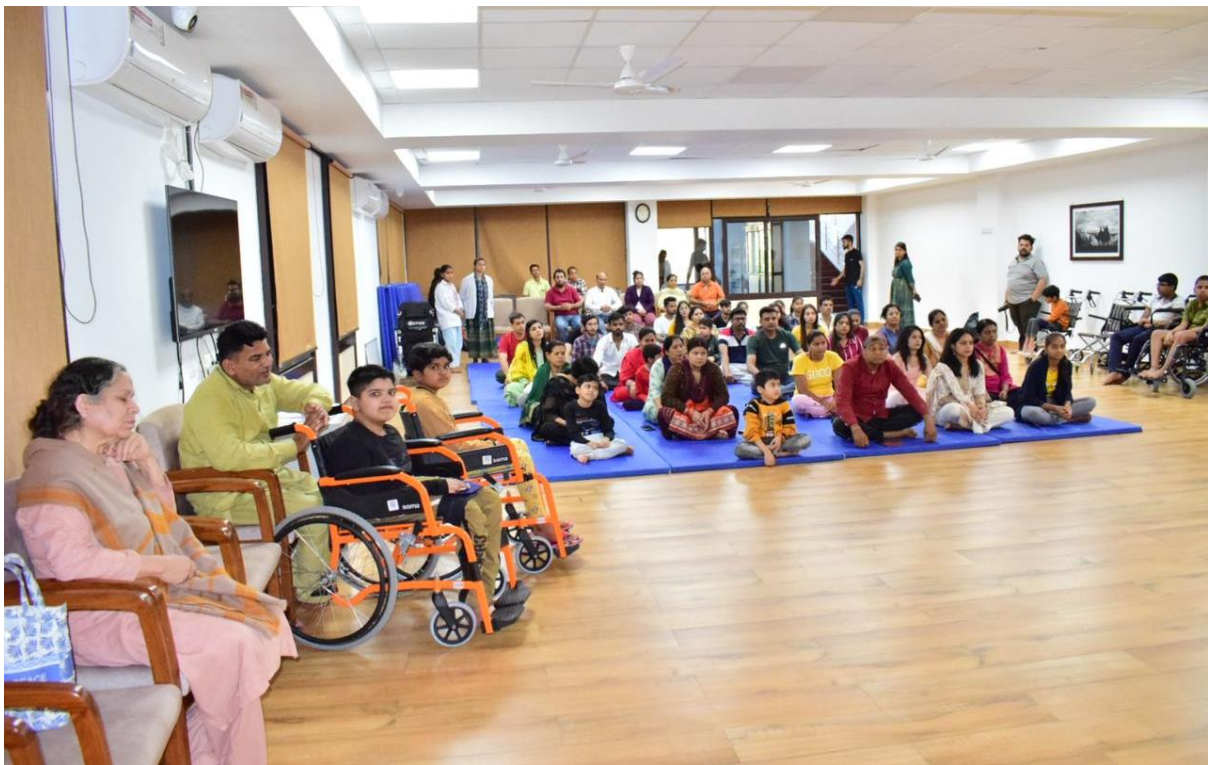
The participants enjoyed the cultural evening