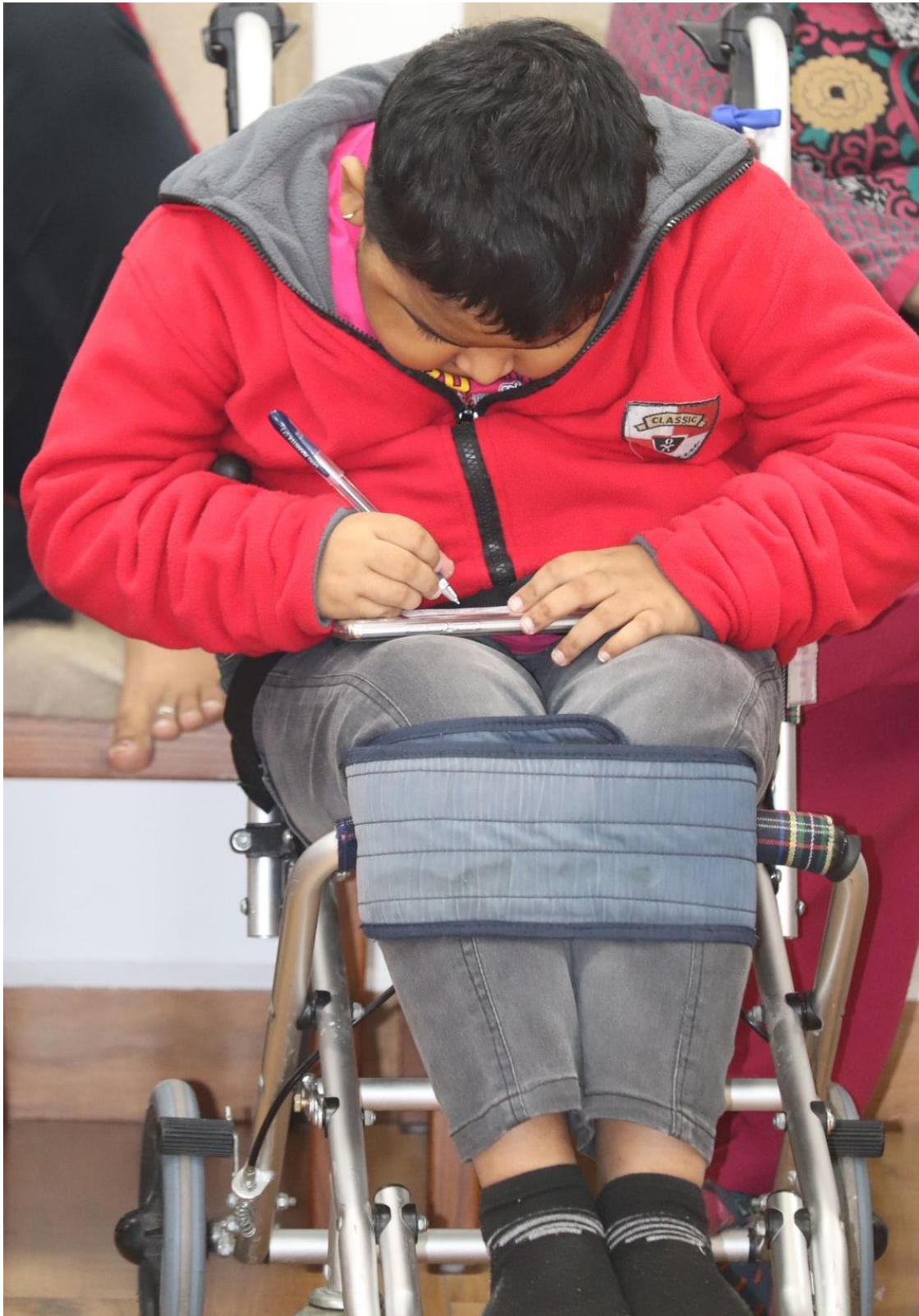
A muscular dystrophy warrior playing Tambola