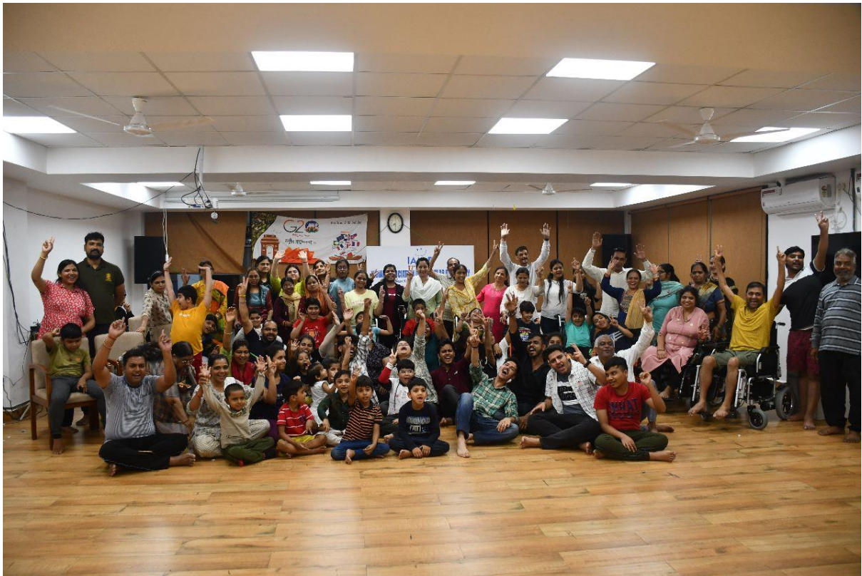
A group photograph of the volunteers