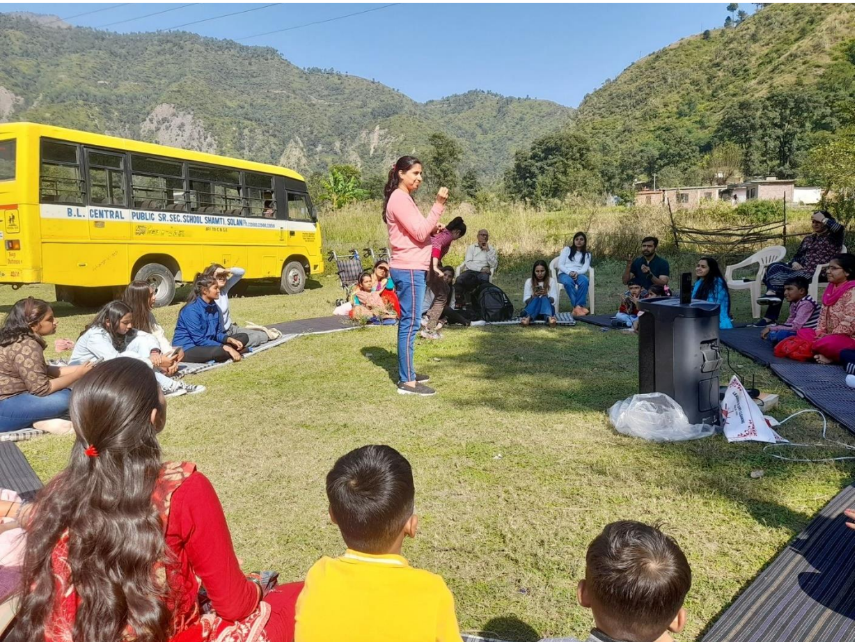
A guardian of a muscular dystrophy warrior sharing her experience