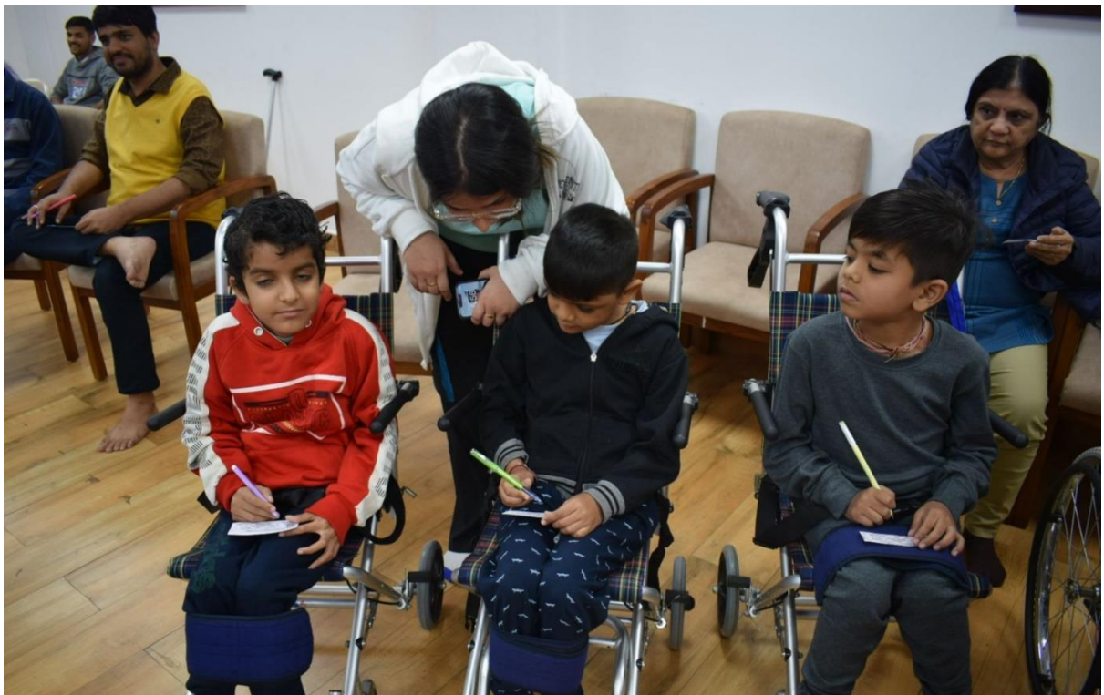
Children playing Tambola