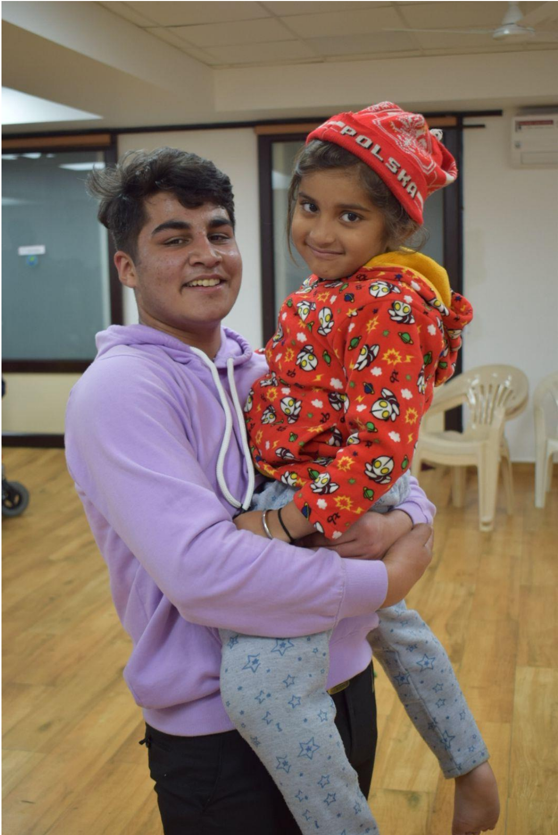
A volunteer with a child