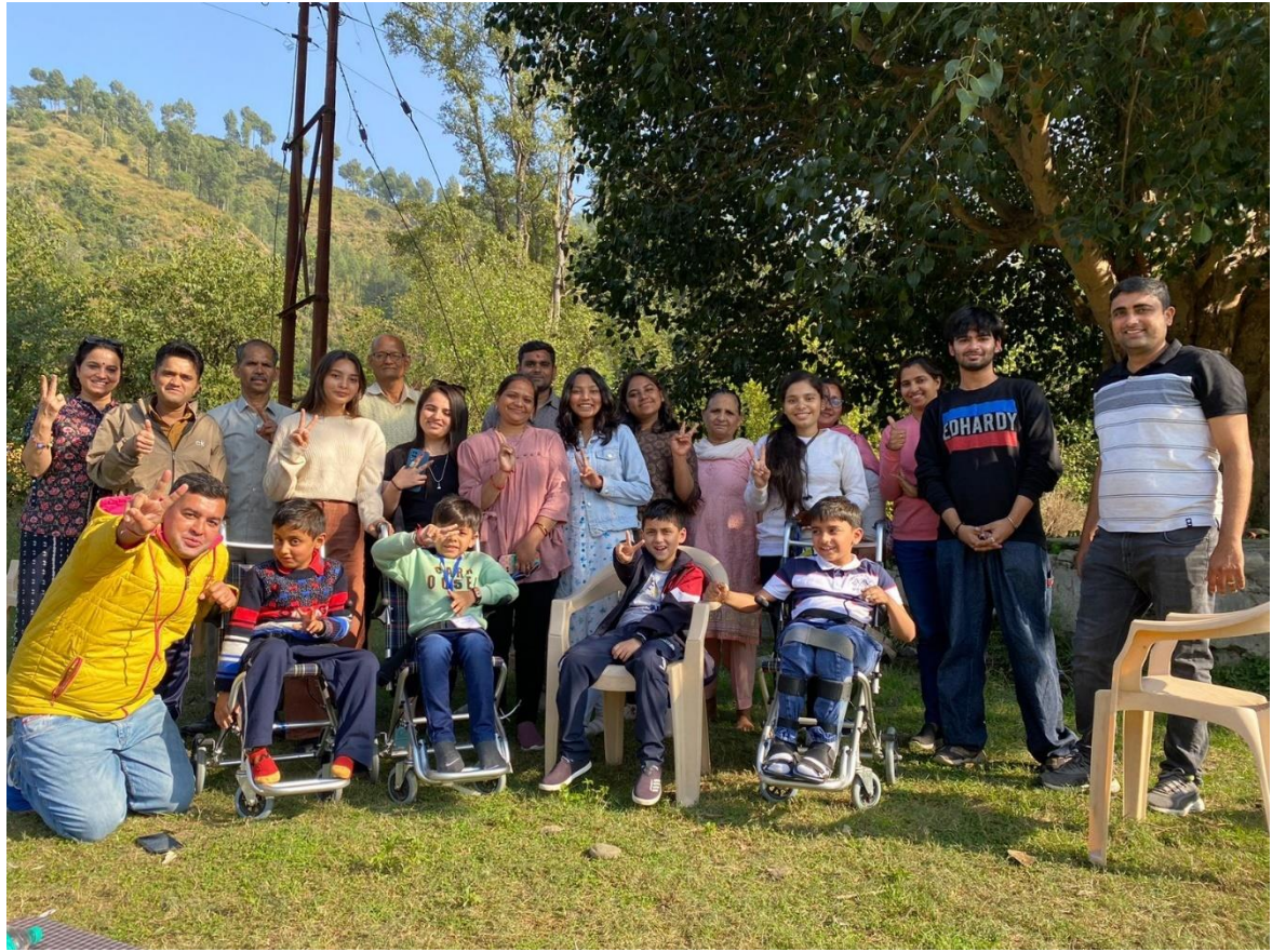
A group photograph of all the participants