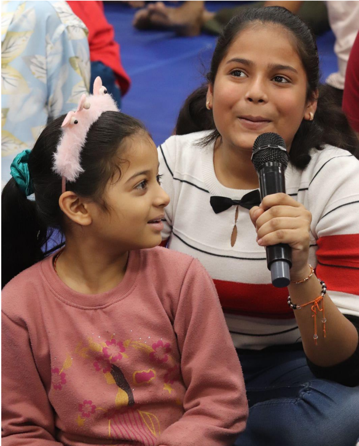
A volunteer talking about fight against muscular dystrophy