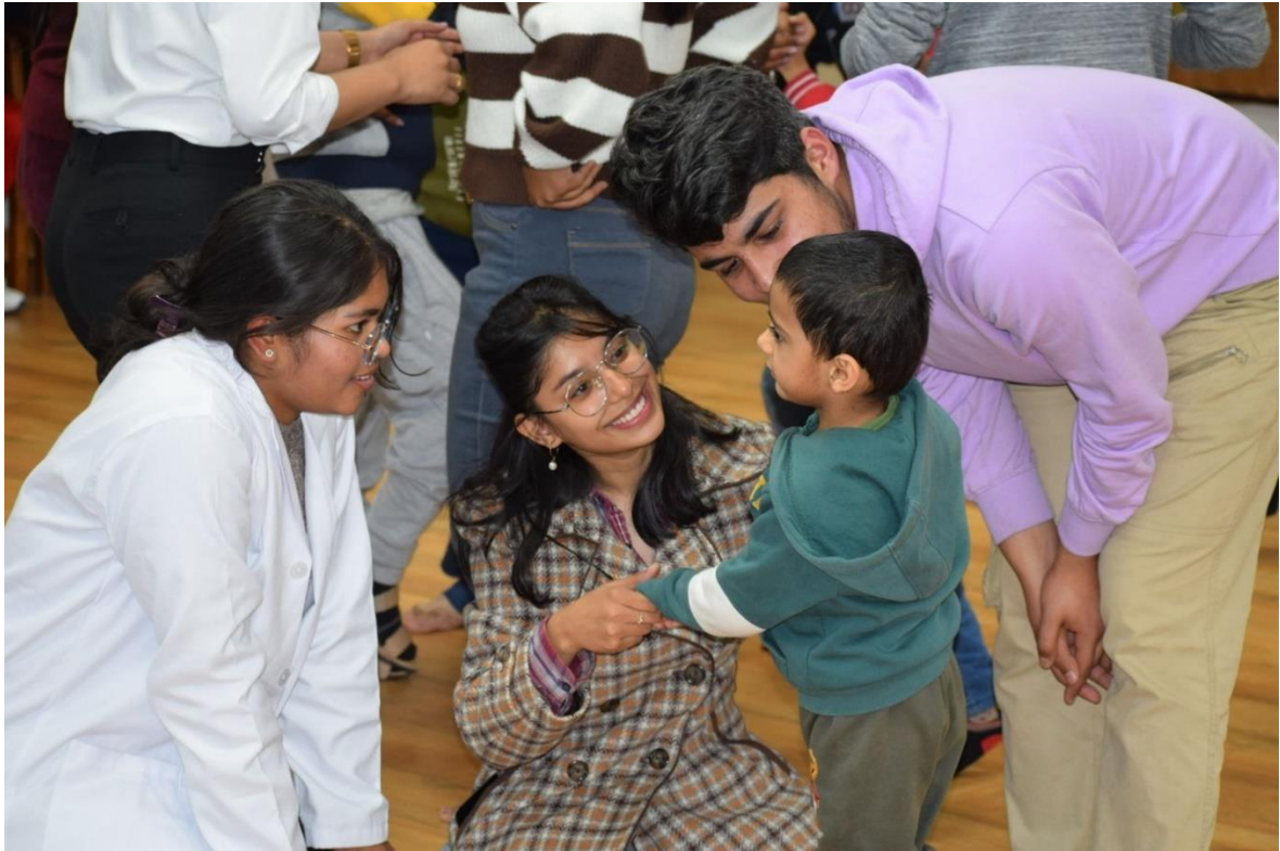
Volunteers talking to a child