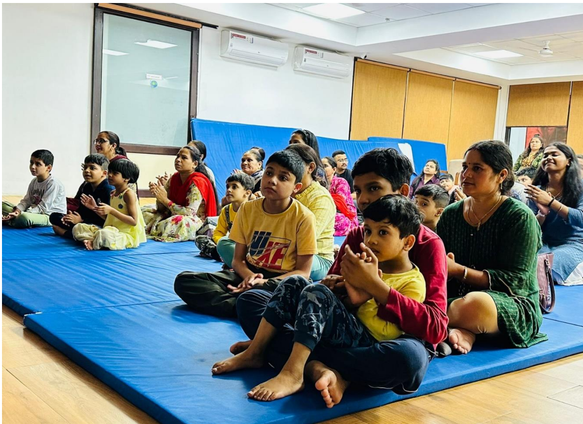
Muscular dystrophy warriors and their guardians attending the cultural evening