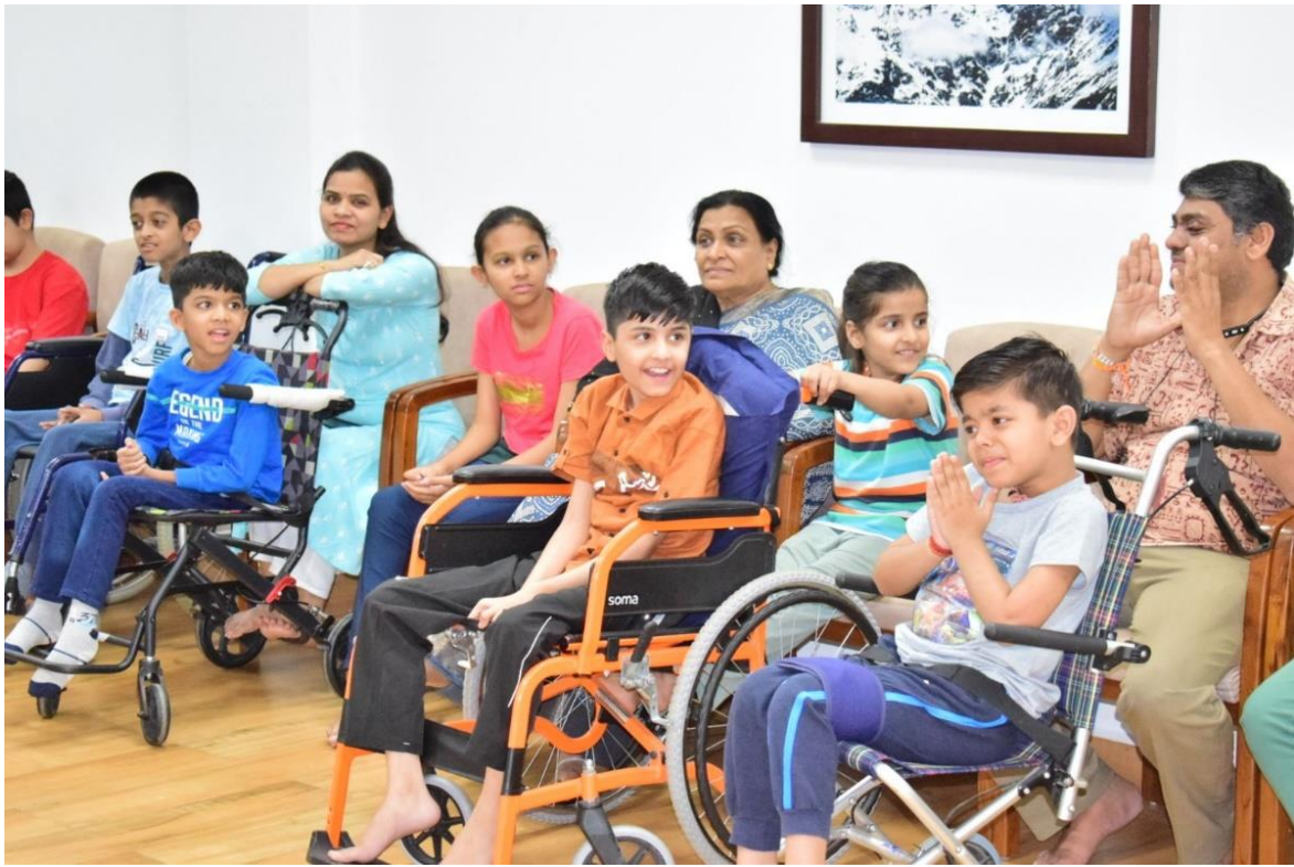
Muscular dystrophy warriors and their guardians enjoying the event