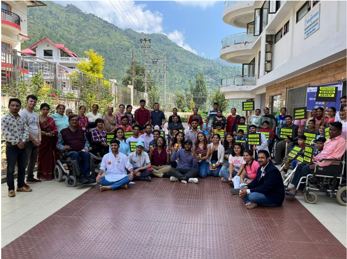
A group photograph of volunteers with the muscular dystrophy warriors, their guardians and IAMD staff