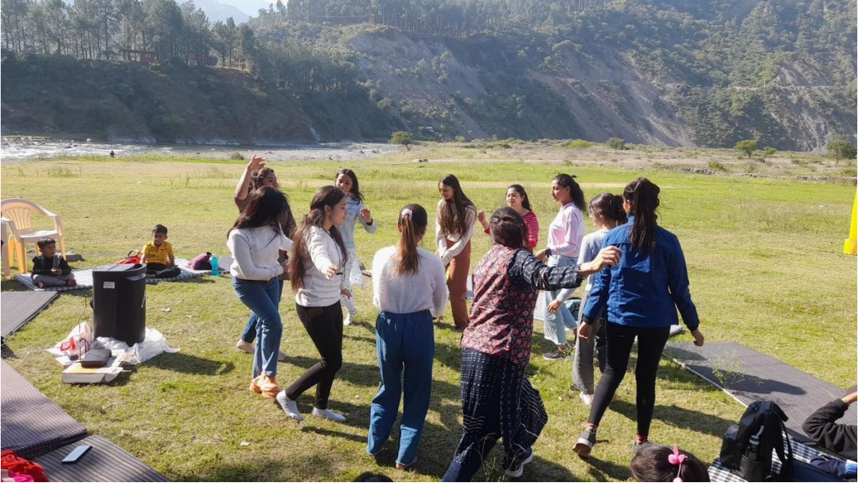
Participants & volunteers dancing