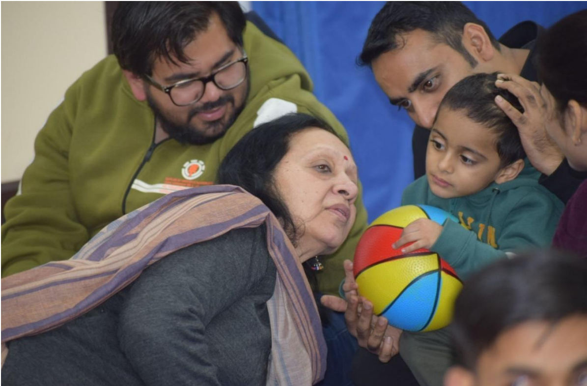
A picture of Passing the Ball game