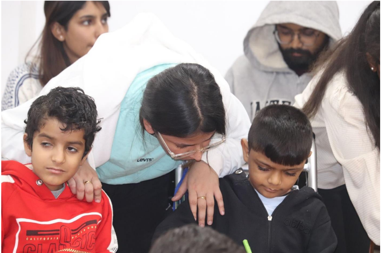
A random photograph of children and volunteers