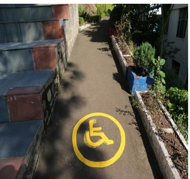
Ramps in Shoolini Campus