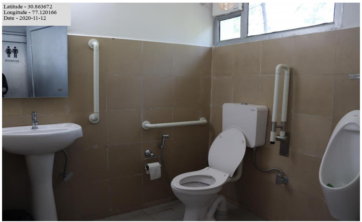
Special washrooms for differently abled