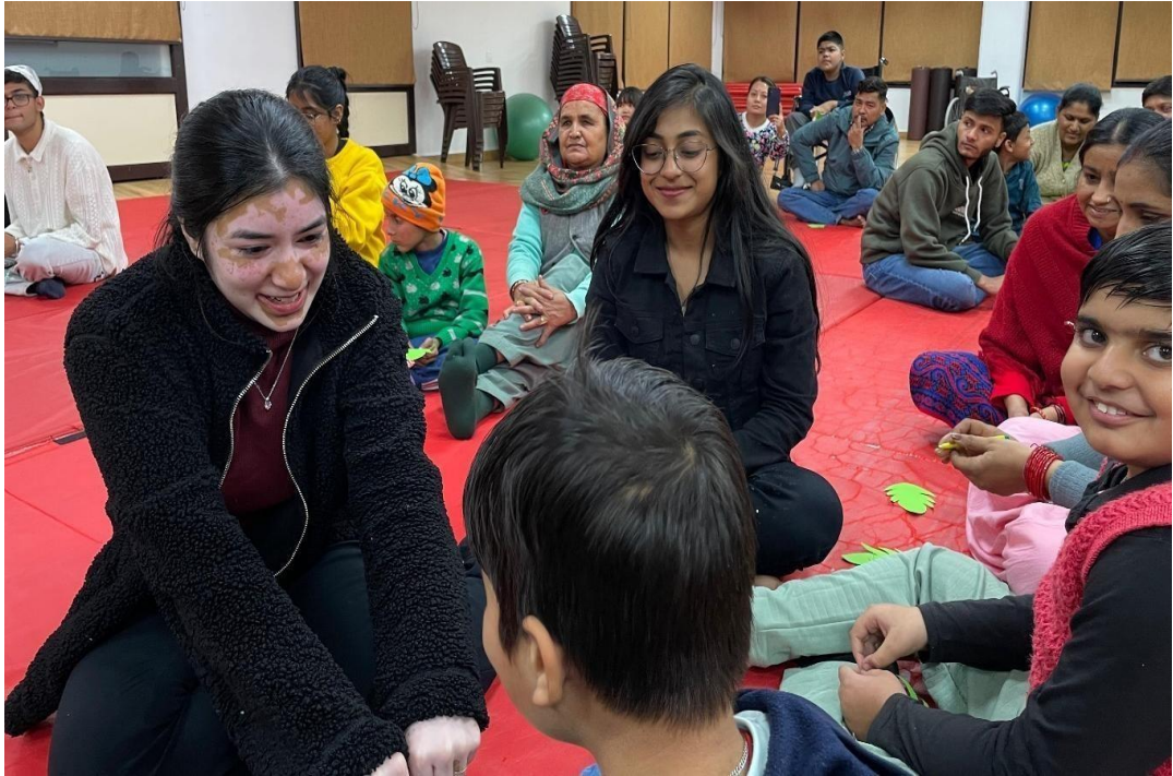
Volunteers socializing with Muscular dystrophy warriors