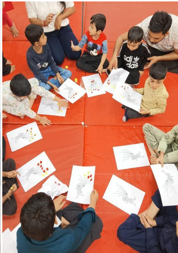
Volunteers with students in IAMD