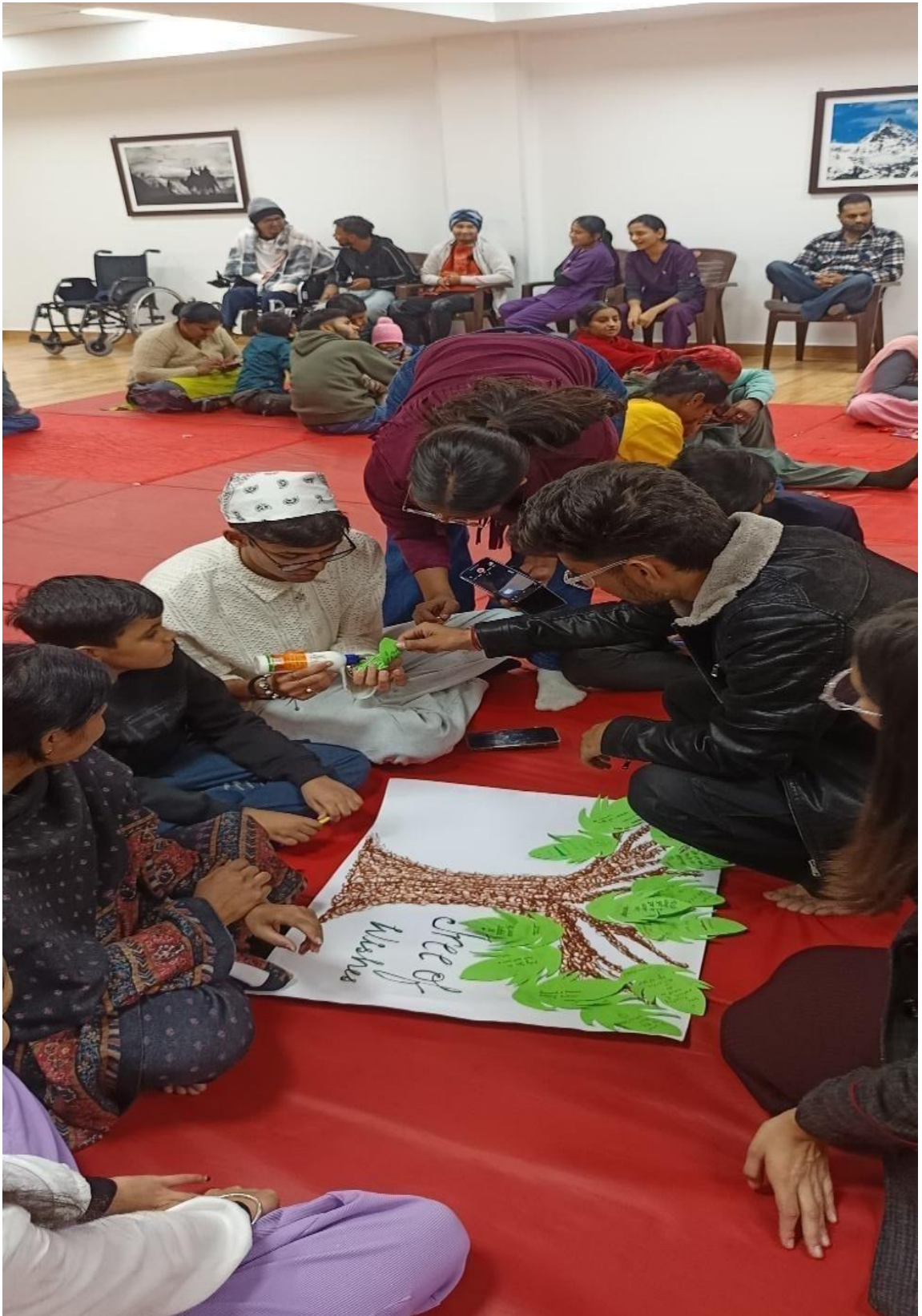
Volunteers making paintings with muscular dystrophy warriors