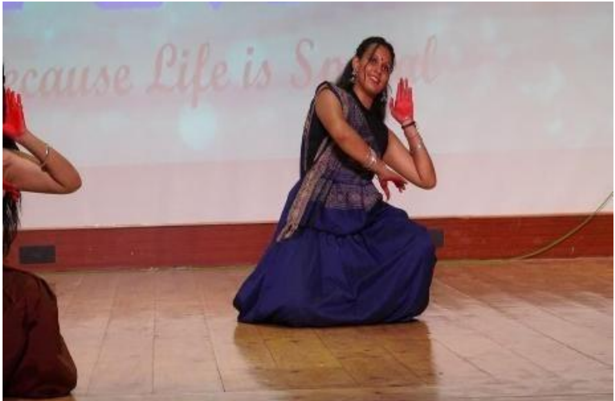
A volunteer presenting a dance performance