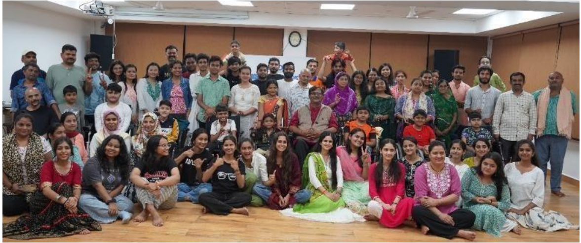
A group photograph of all the participants