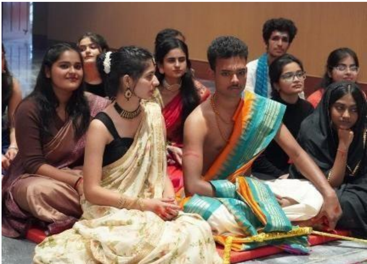
These volunteers presented a play on Lord Rama