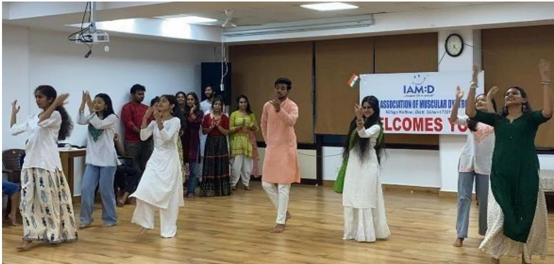
Dance Performance being presenting by the students