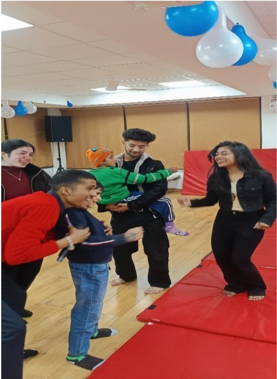
Volunteers spending quality time with muscular dystrophy warriors