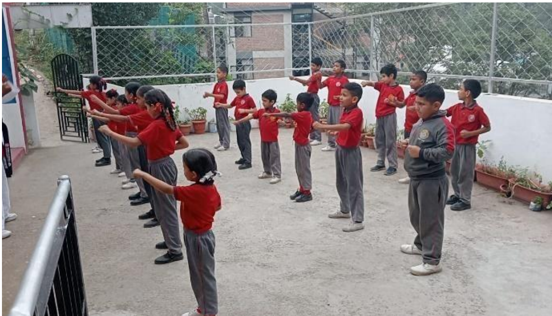
School children during a Karate Class

Through this initiative, Shoolini University fosters a supportive learning environment that empowers school students and enhances community engagement while promoting a sustainable future.