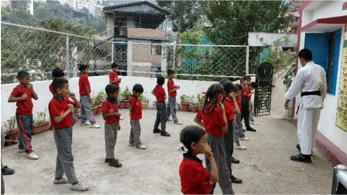
A volunteer conducting Martial Arts Class