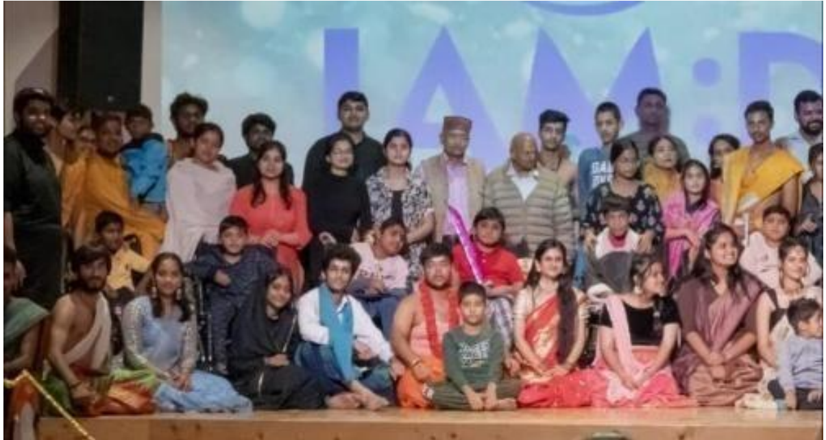
A photograph of all the participants