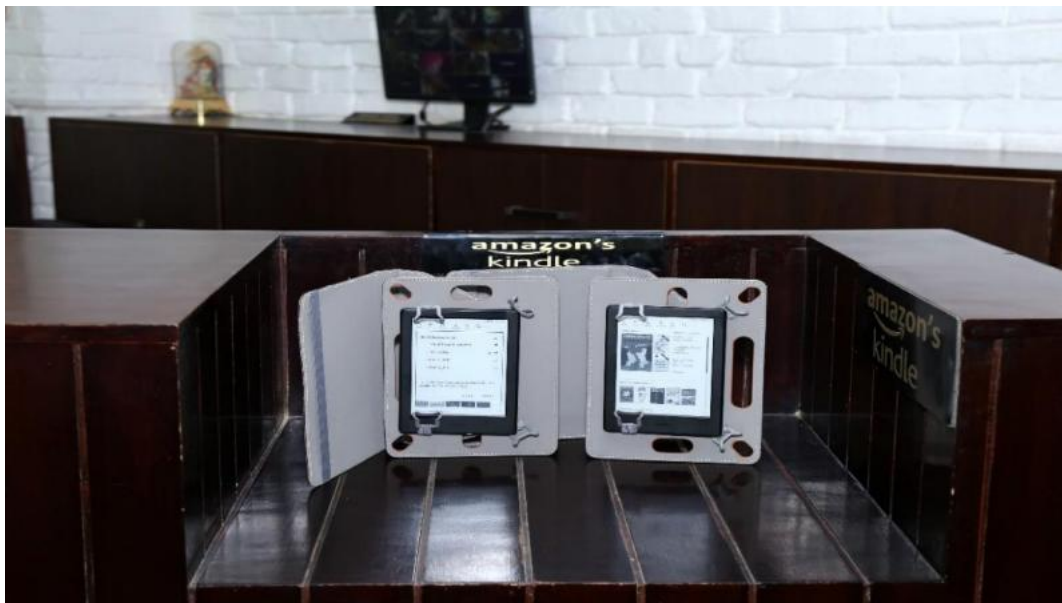
Amazon kindle for reading in library

Additionally, users can save personalized settings and switch between reading modes, while large display options enhance readability by enlarging text and icons. These provisions ensure a comfortable and accessible learning environment, supporting inclusive education for visually challenged individuals.