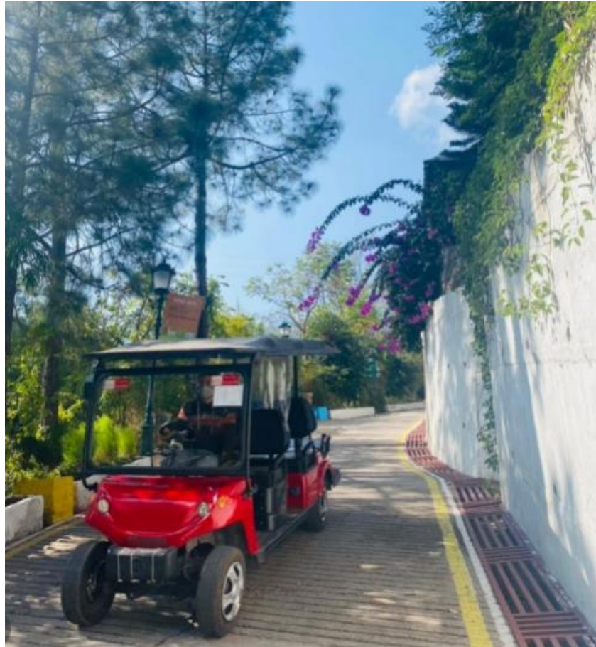
E-cart service inside the campus