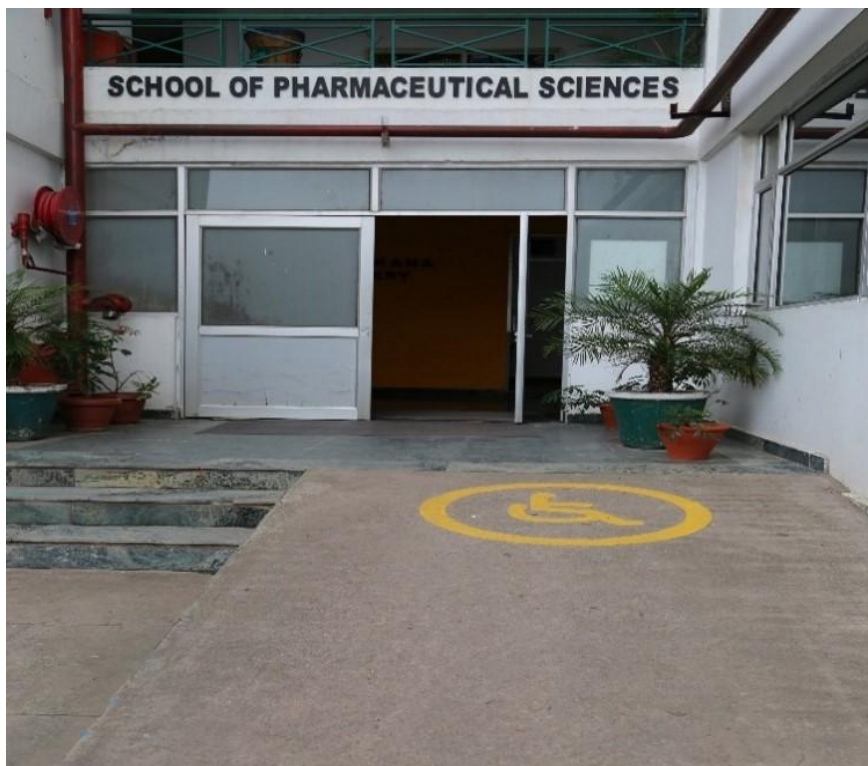
Pathway to Pharmacy Block