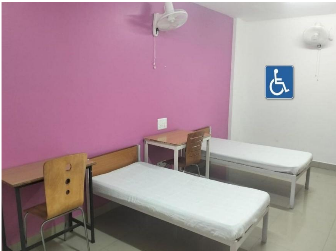
Specially abled room in Girl hostel

These facilities ensure seamless mobility, independent living, and equal participation for persons with disabilities across academic and campus life.