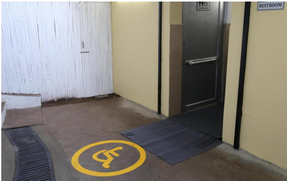
Washroom near Director Operations office