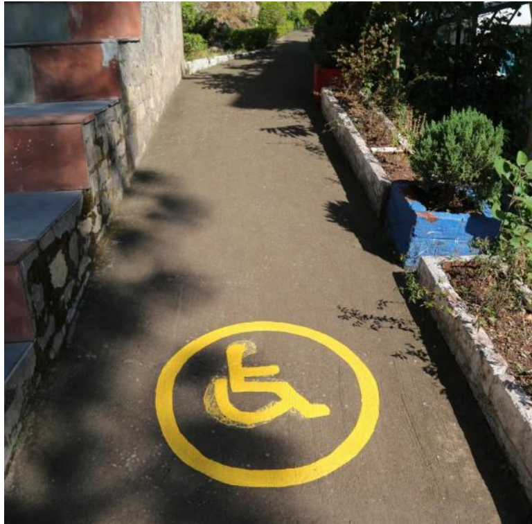
Ramp access near OAT to RTH