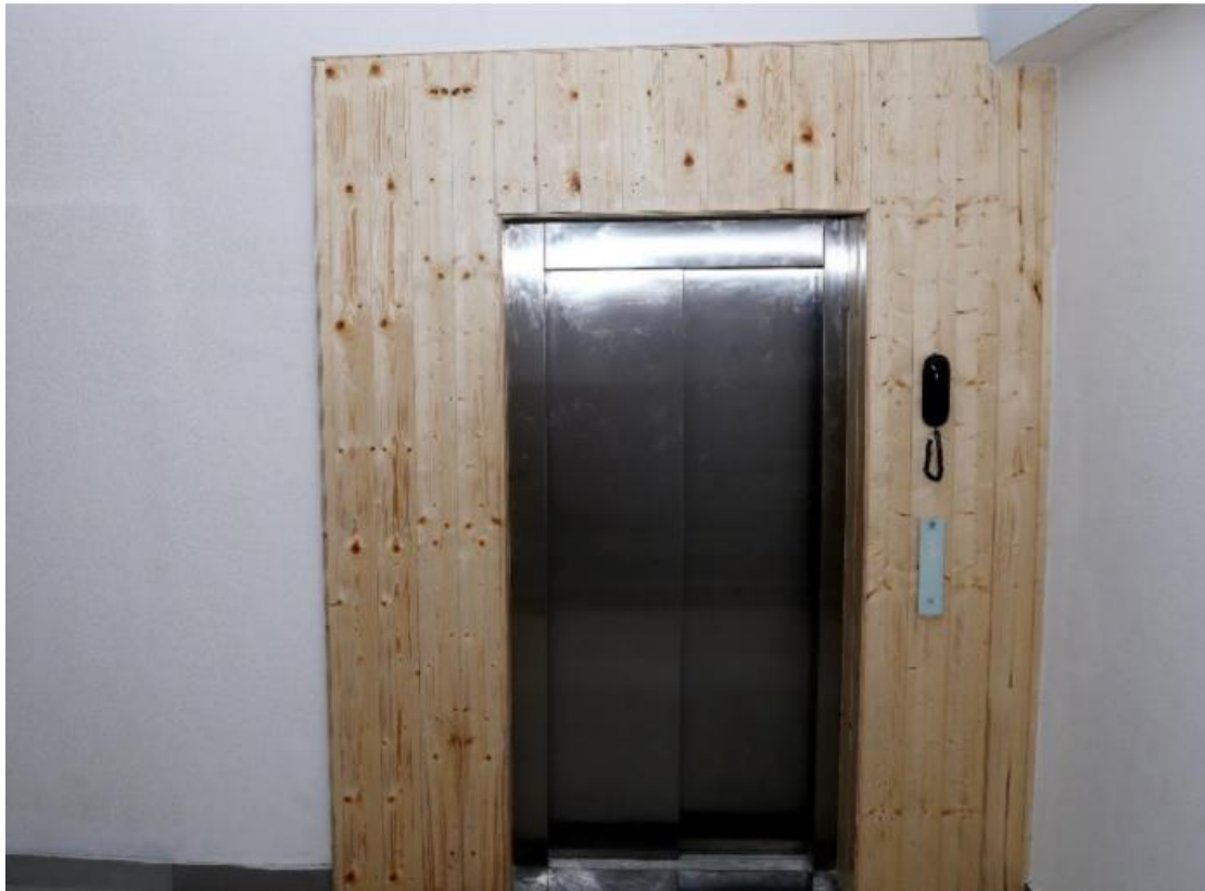
Lift in G Block