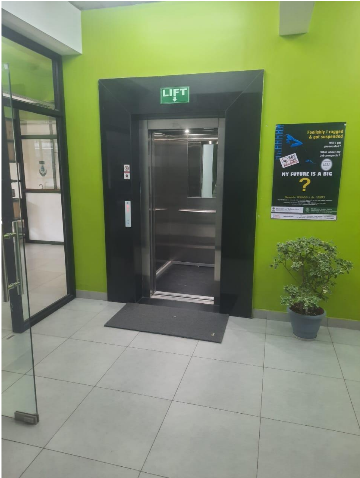
Lift at Shoolini Residences A-block Hostel