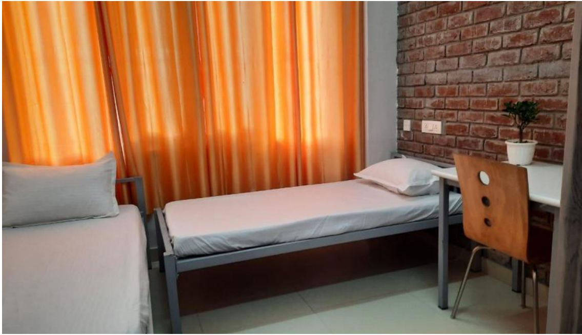
Specially abled room in Boys hostel