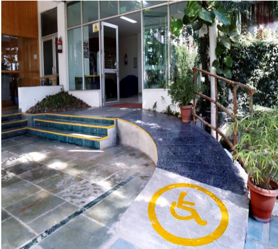
Pathway for Differently Abled person near Admin block