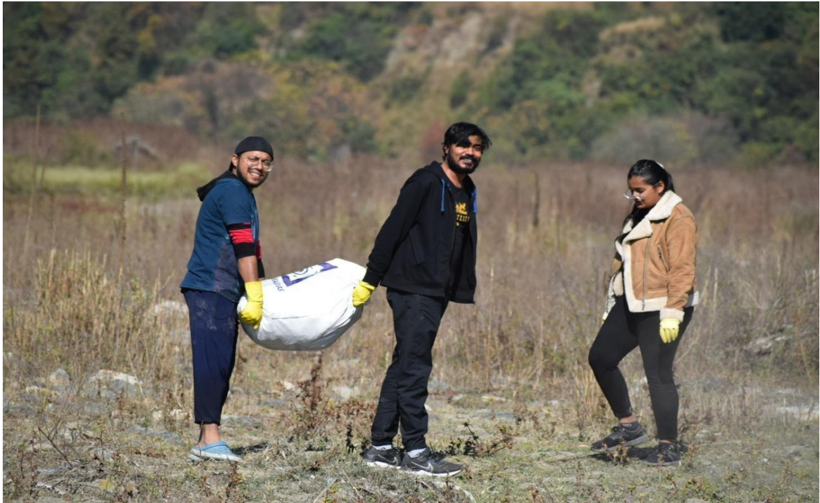
Volunteers carrying bags filled with plastic.