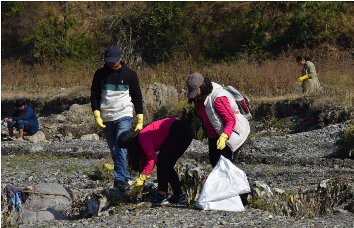
Volunteers picking up plastic at the riverside area