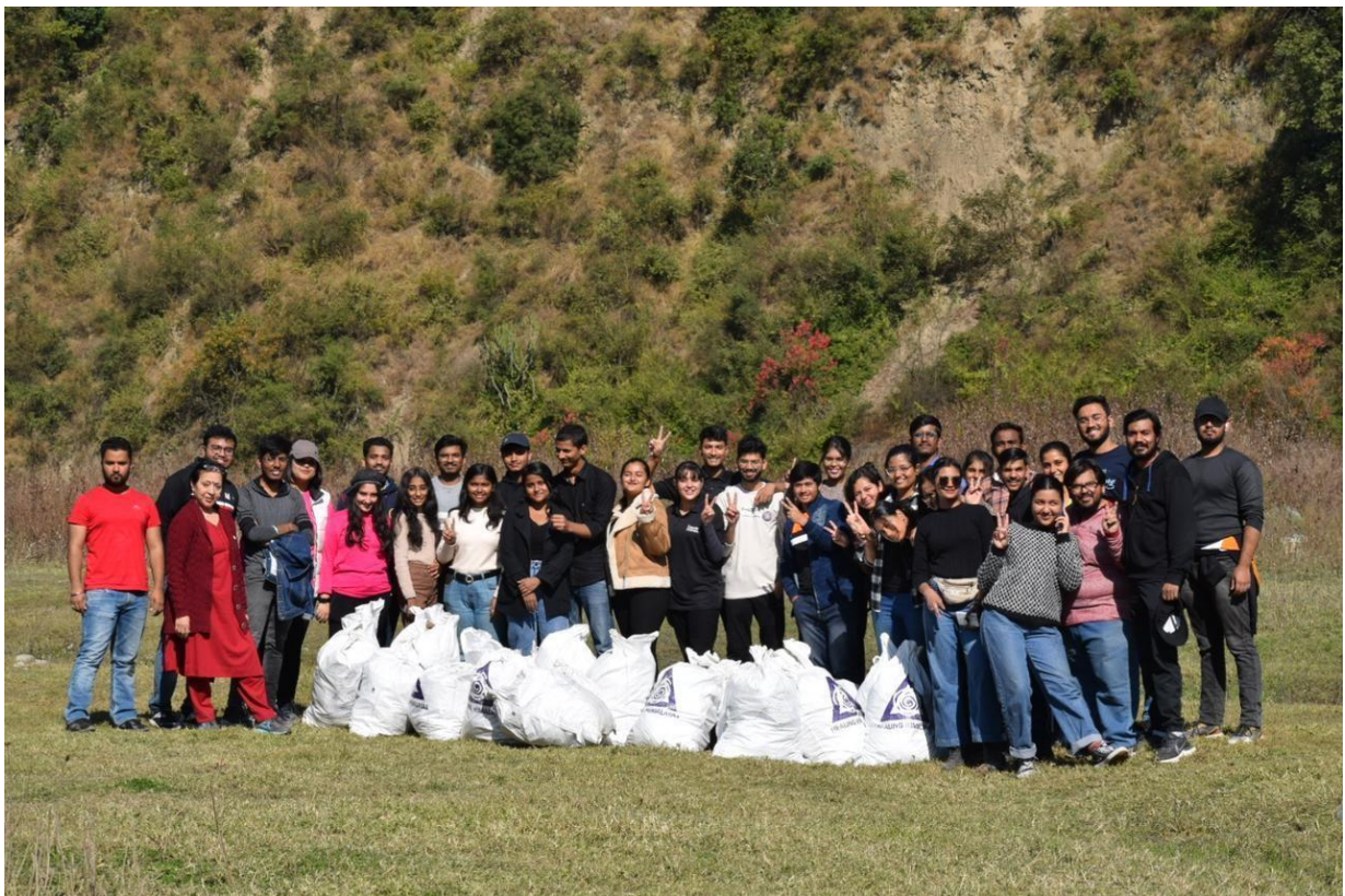
Volunteers with bags full of plastic collected by them.