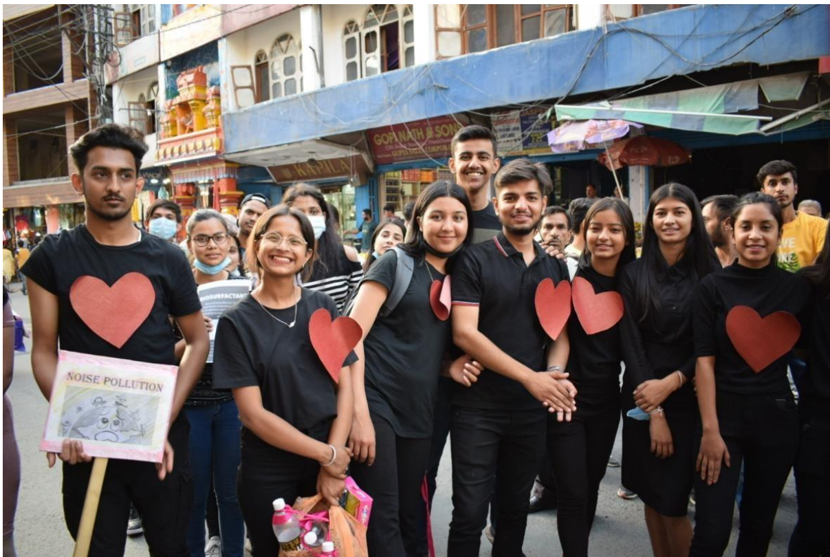
Photograph of volunteers

Shoolini University on the occasion of World Earth Day concluded its Swachhata Pakhwada campaign which started on April 5, 2022. Swachhata Pakhwada was initiated in the university among the different faculty to promote cleanliness and sustainability. Different schools presented various ideas to promote sustainability. The schools conducted cleanliness drive and awareness campaign in and around the campus. Some schools went to nearby villages to teach them. The concept and their ideas were applauded by the local authorities. The event concluded with a flash mob where children dressed up with various animal masks and hearts explained the importance of environment conservation. The students picked various songs related to nature and engaged the public with their dance efforts. Plants were also distributed during the entire event to the local people. The local people and the administration appreciated the effort. Certificates and refreshments were provided to the volunteers for their exemplary effort. Number of students participated: - 55