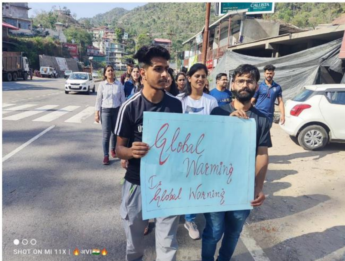
Volunteers participated in the walk on the road to save mother earth