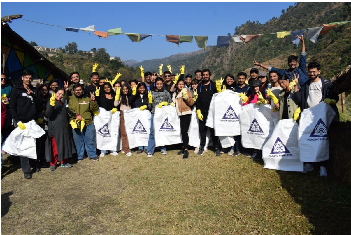
Picture of volunteers