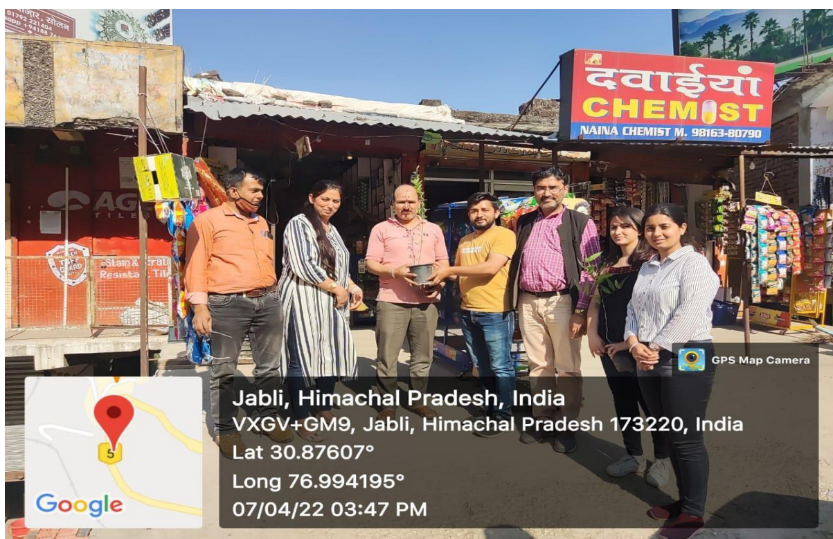
Volunteers sharing plant sapling with the locals