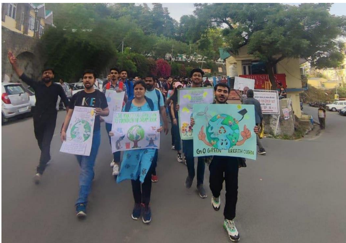
Posters made by the volunteers