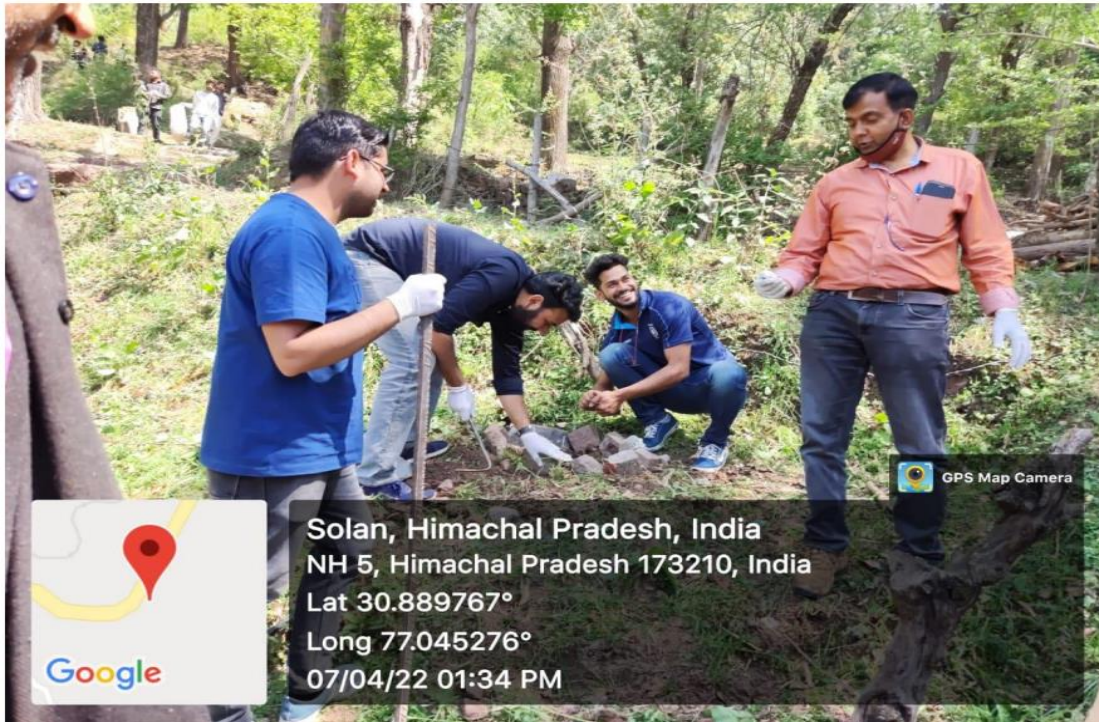
Volunteers planting the saplings nearby the National Highway