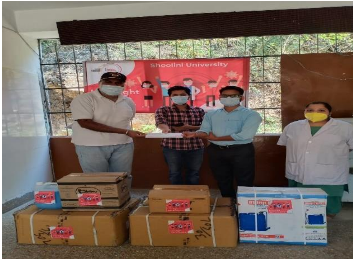
Handed over to Medical Officer In-charge, PHC Chandi