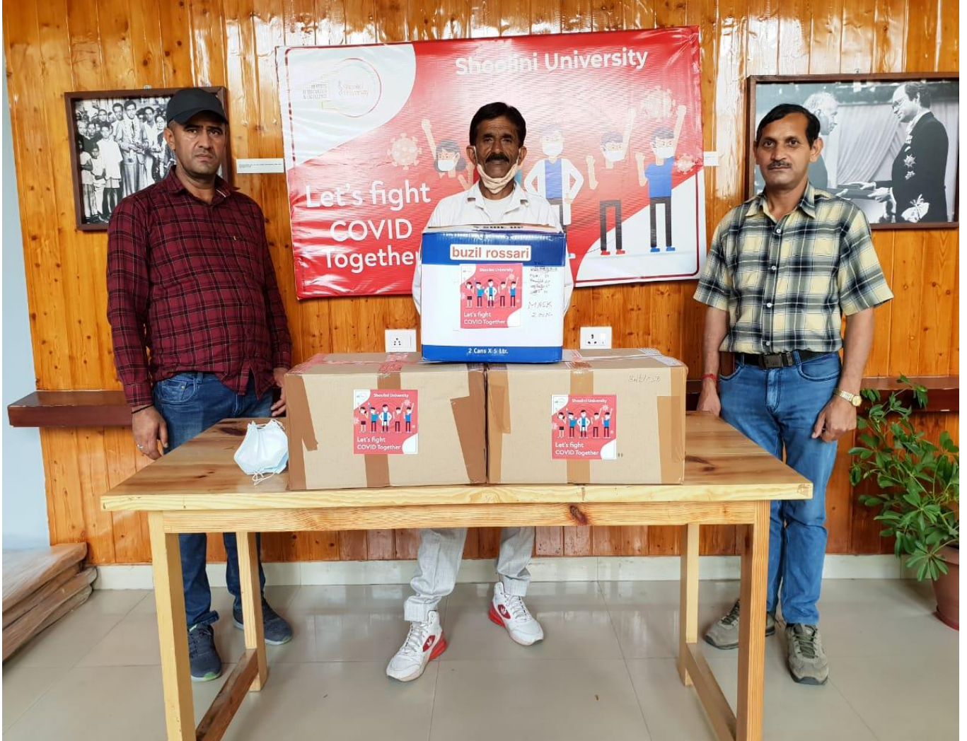
Handed Over to Up Pradhan, Gram Panchayat Sultanpur