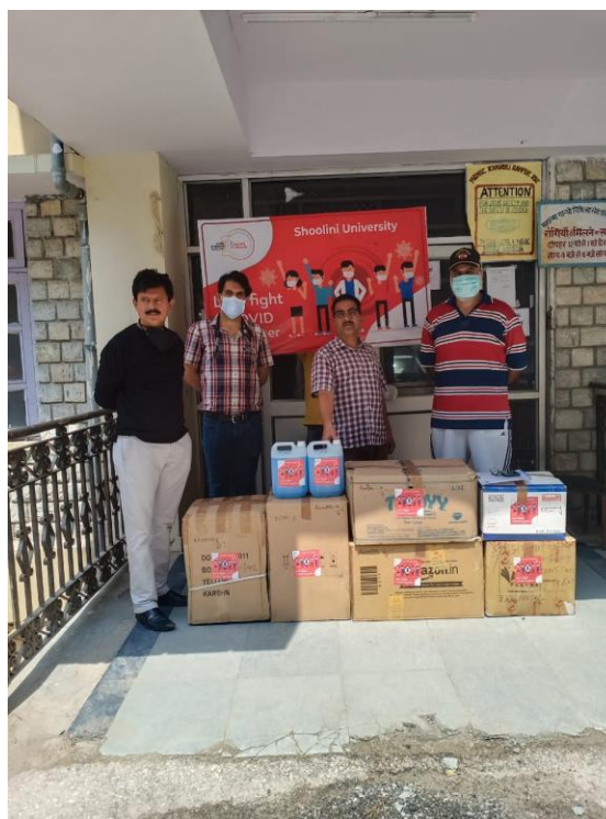
Handed Over to Medical Superintendent