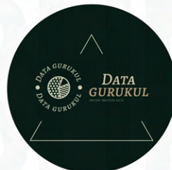
BUSINESS ANALYTICS CLUB