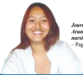
Journey from Arunachal to Himachal nursing a dream – Page 2