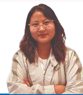
Learning among books at Penguin Random House – Page 3