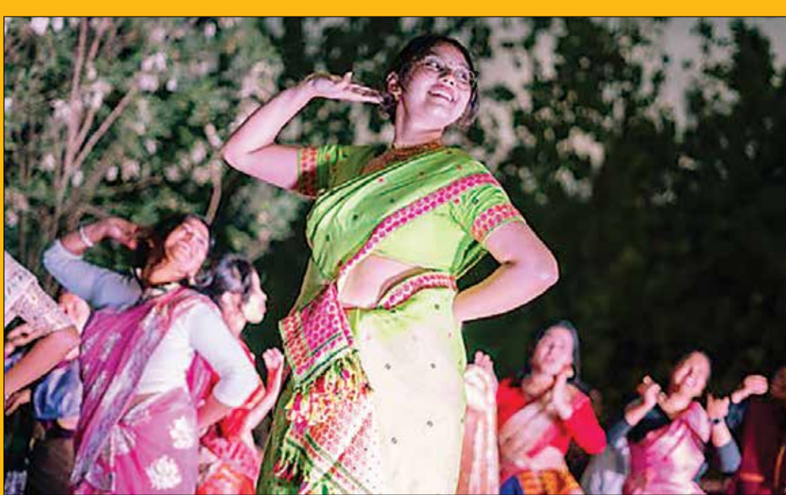
A cultural event, 'Unity in Diversity', by students from the North East, proved to be a big hit. It was organised by Dean Students Welfare Office.